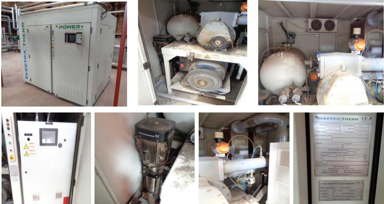
Electra Therm ET.50 4000WL organic rankin Cycle (ORC)/waste heat generator (2018)