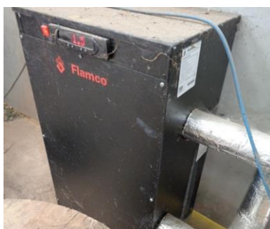
Flamco Flexfiller 225D pump