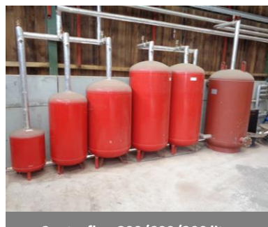
Contraflex 800/600/300 litre pressure vessels