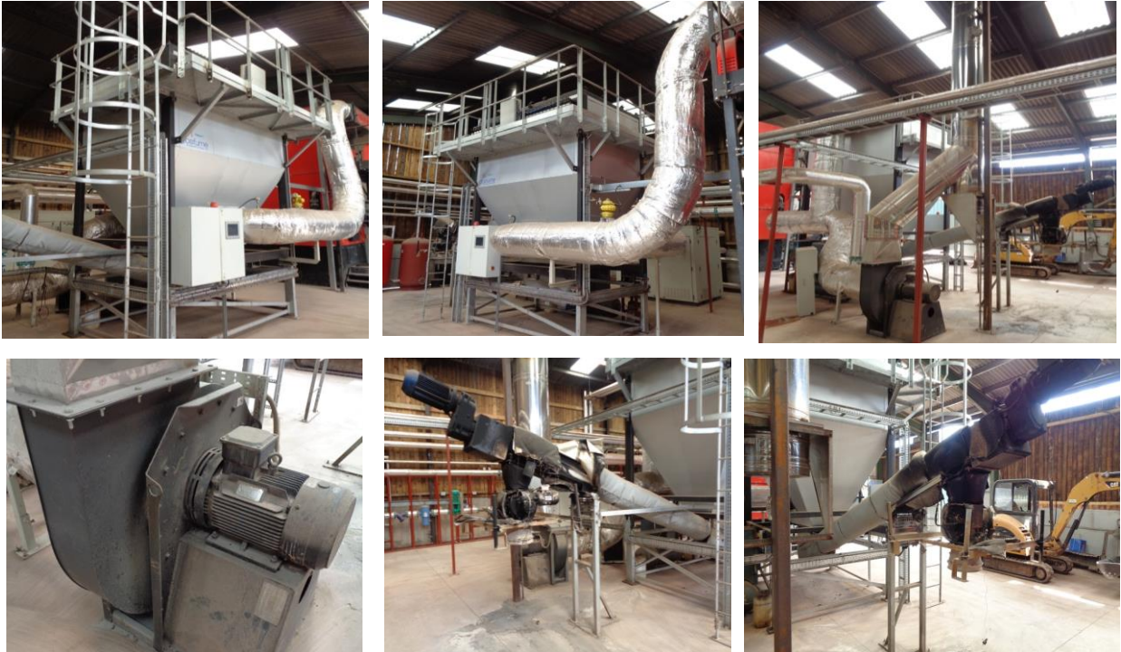
Glosfume gas/smoke filtration unit, with RHF Fans HF8 600 T5 industrial fan (2018)