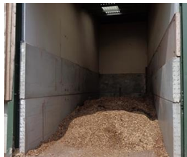
Hydraulic dual ram driven walking floor