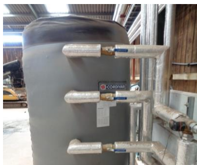
Cordivari buffer tank, model 200