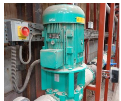
Wilo IL50/210-11/2 drive motors (2 off)