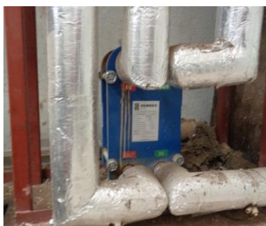
Sandex plate type heat exchanger