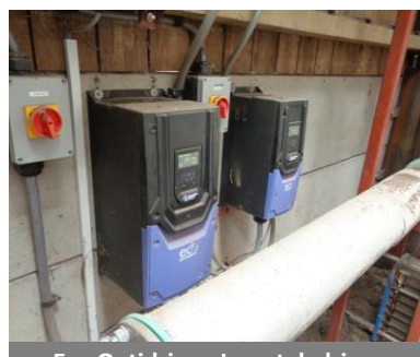
Eco Optidrive Invertek drives (2 off)