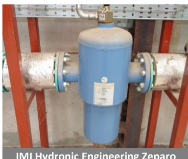
IMI Hydronic Engineering Zeparo G-Force, ZG 100F, automatic vent separator