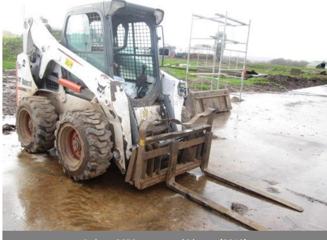
Bobcat S650 compact skid steer(2010)

AA Silos 12ton freestanding feed hoppers (6off)