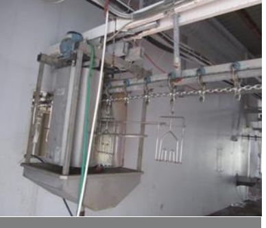
Bayle type LG700 line washer