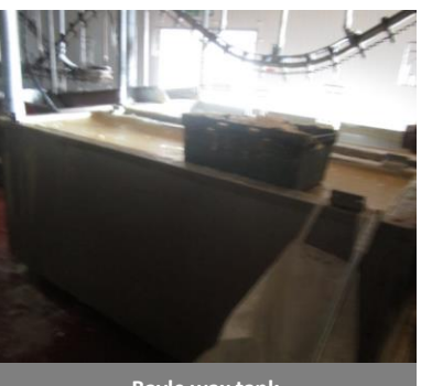
Bayle wax tank