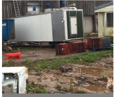
Bespoke hot box and steam tunnel