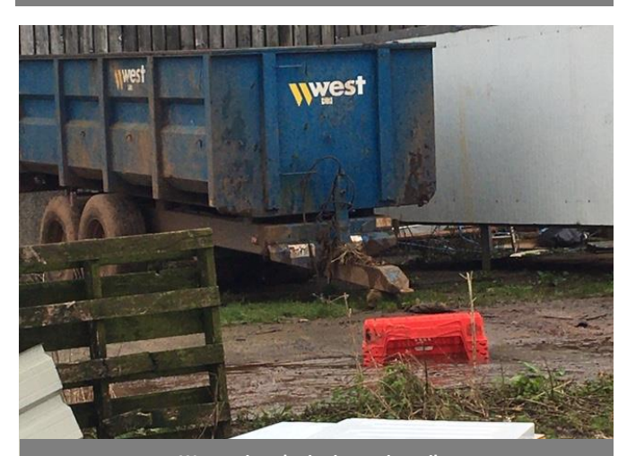
West twin axle tipping grain trailer

Peter Allen auger hopper filler single axle feed trailer