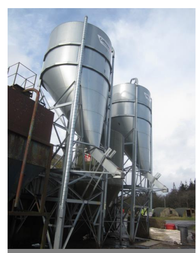
Collinson Agriculture storage silos capacity 36m<sup>3</sup> (2017 – 2off)