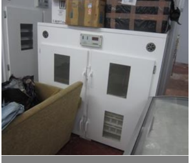
Heka-Brutgerate egg hatcher (2015)