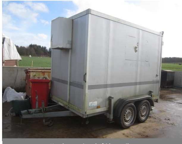
Hambaur twin axle fridge trailer