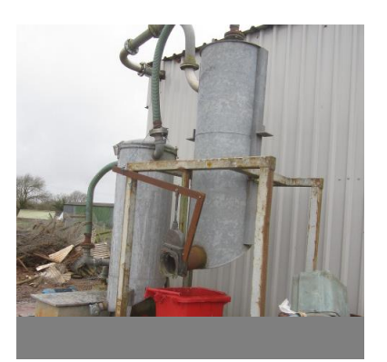
Poultry wing stripping machine