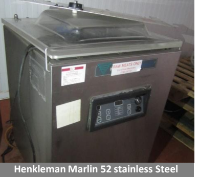
vacuum packing machine