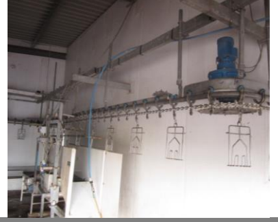
Poultry conveyor line