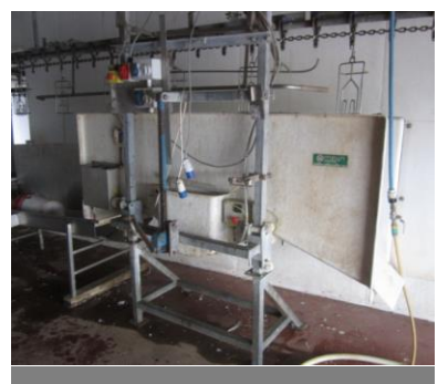
Meyn bird stunner electric water bath