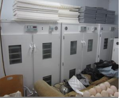
Heka-Brutgerate 2000 egg incubators (3off)