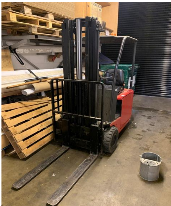
Lansing Bagnall forklift truck