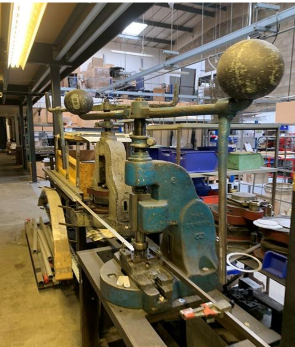
Various fly presses