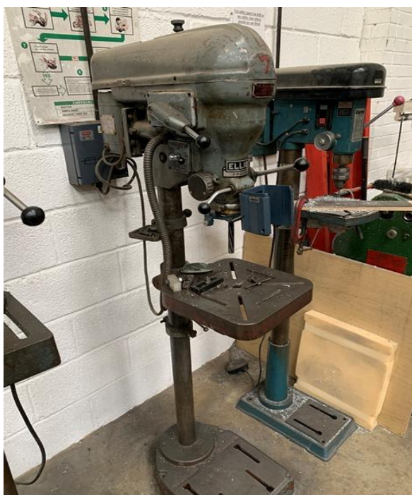
Elliot Progress No.2G pillar drill