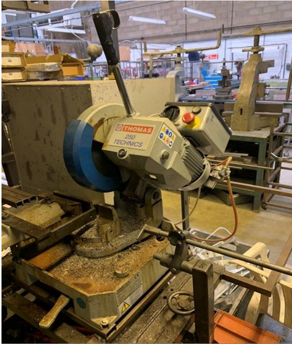
Thomas 250 chop saw