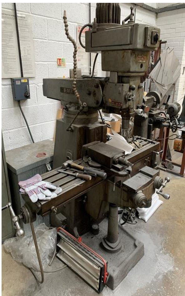
Balding Engineering Beaver VBRP milling machine