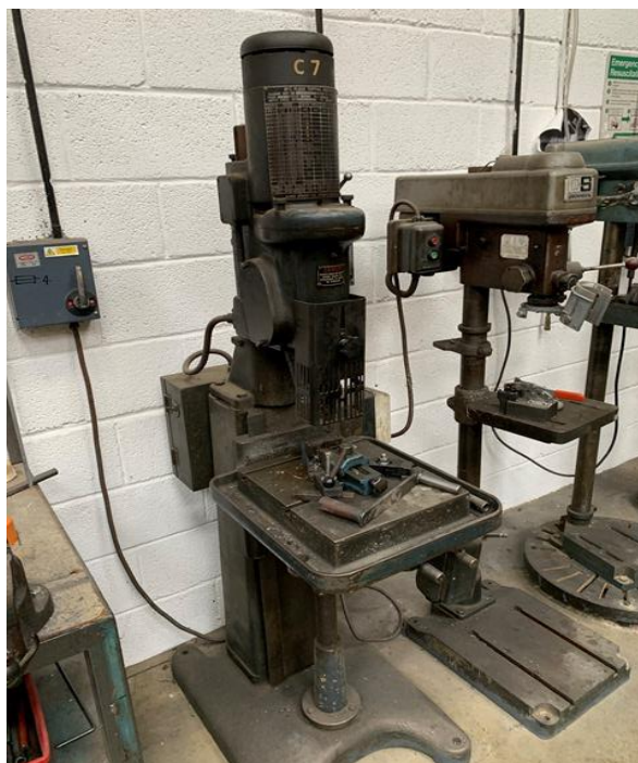
Herbert No.2 flash tapping machine