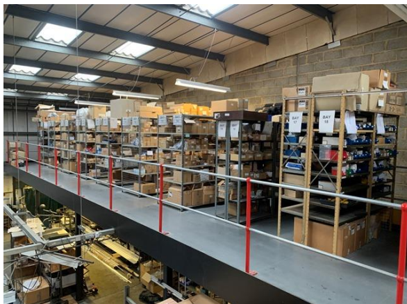
Stock of lighting component parts, general fixings and cabling