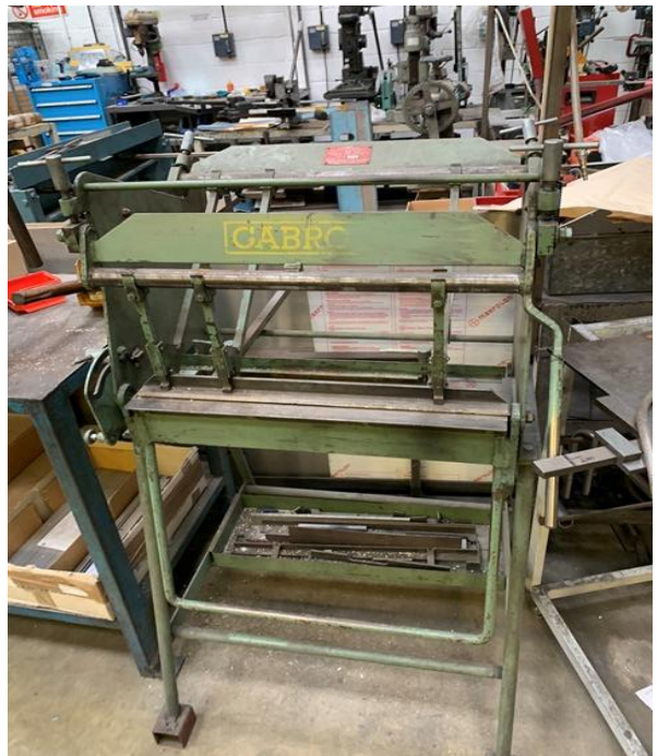
Gabro BF620 box folder