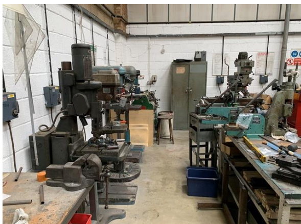
Various workshop equipment