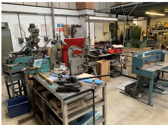
Various workshop equipment