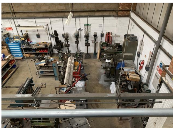
Various workshop equipment