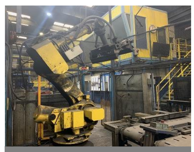
Fanuc R-200ib multi axis loading insert robots