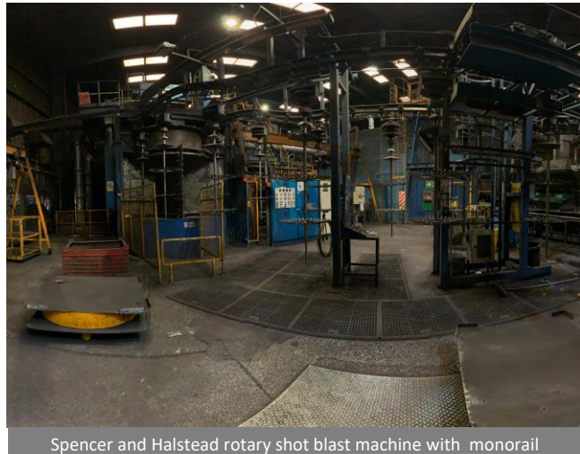
infeed and outfeed system