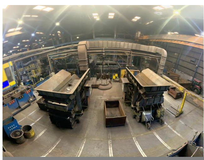
Vibratory Hopper Feeders 2-off with outfeed to furnaces