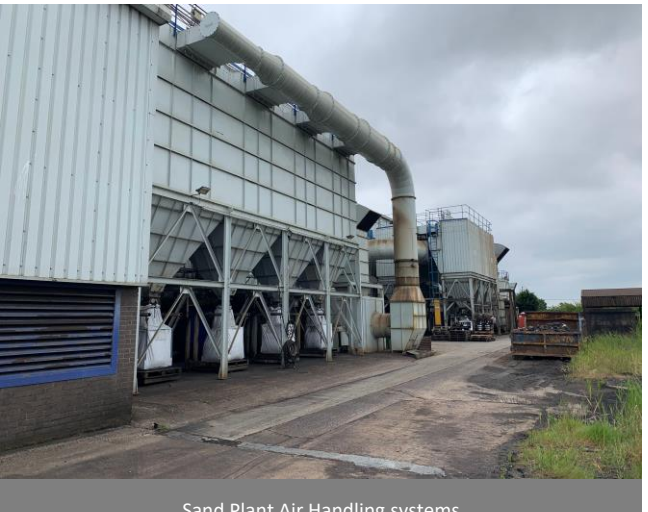
Sand Plant Air Handling systems