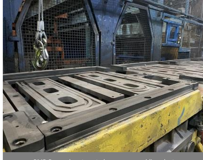
BMD Dynapuls automated conveyor moulding plant