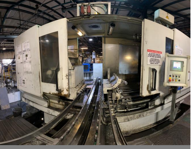
Tibo multi spindle gun drills, 6-off 2001 – 2012