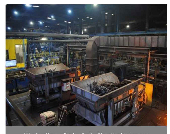
Vibratory Hopper Feeders 2-off with outfeed to furnaces