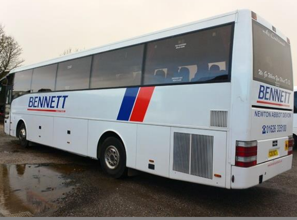
Scania K124 Van Hool 70 seater coach, reg no C20 BCT (2001), MOT 9/3/21, tachograph reading 1,070,579, air con, TV, 7 speed comfort box, converted to 70 seaters approx 4 years ago