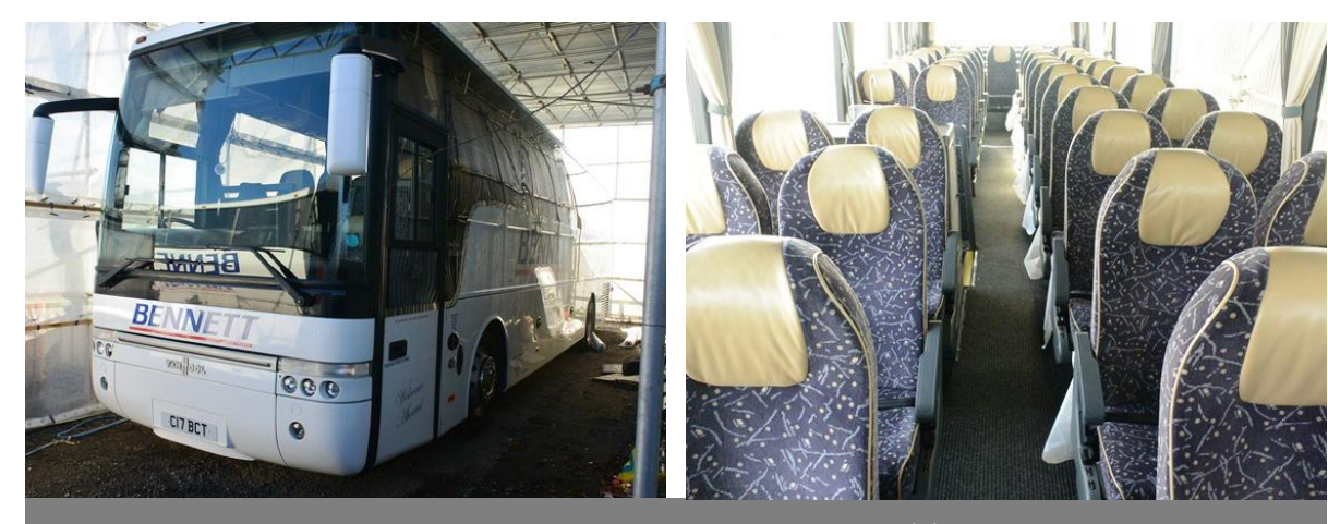
Volvo B12B Van Hool 49 + 4 executive seater Euro 3 coach, reg no C17 BCT (2006), MOT 3/8/21, tachograph reading 350,451 kms, fittedcentral toilet ,air con, TV, with seating and floor plan to configure into 53 seater