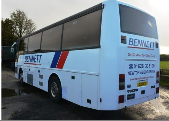
Volvo B9M Van Hool 38 executive seater Euro 4 coach, reg no C12 BCT 1996), MOT 30/9/21, tachograph reading 781,610 kms, fitted rear toilet, air con, TV, 6 speed box