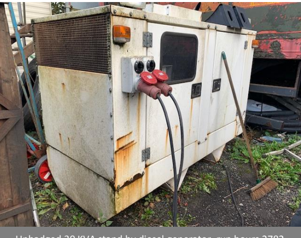
Unbadged 30 KVA stand by diesel generator, run hours 2782