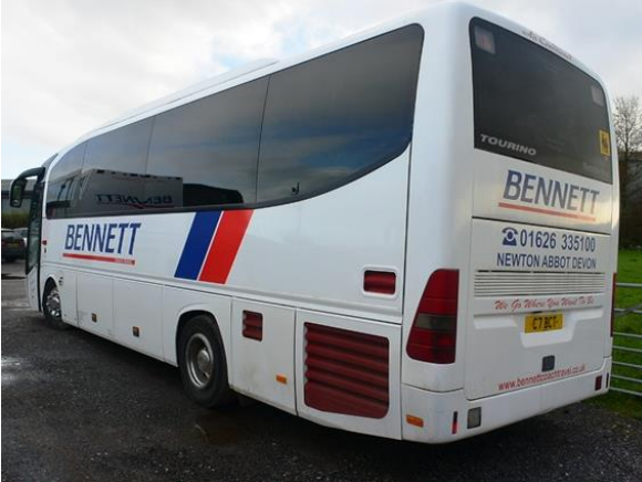
Mercedes 0510 Tourino 34 seater Euro 3 midi coach, reg C7 BCT (2006), tachograph reading 462,827 kms, air con, TV, 6 speed box, rear door, seat width adjustment