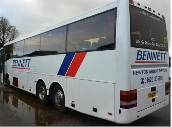
Volvo B10MT Van Hool tri-axle 55 seater executive Euro 3 coach, reg no C8 BCT (1999), MOT 14/2/21, tachograh reading 927,939 kms, air con, 7 speed, interior refurb 2/3 years ago