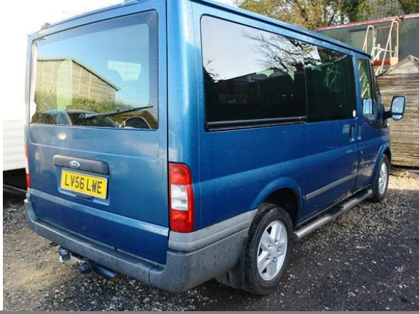
Ford Transit Tourneo GLX 130 diesel 9 seater mini bus, reg no LV56 LWE(2006), MOT 2/10/21, recorded mileage 236,945, replacement engine from Ford approx. 80,000 miles previous, fitted alloys and tow bar