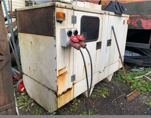
Unbadged 30 KVA stand by diesel generator, run hours 2782