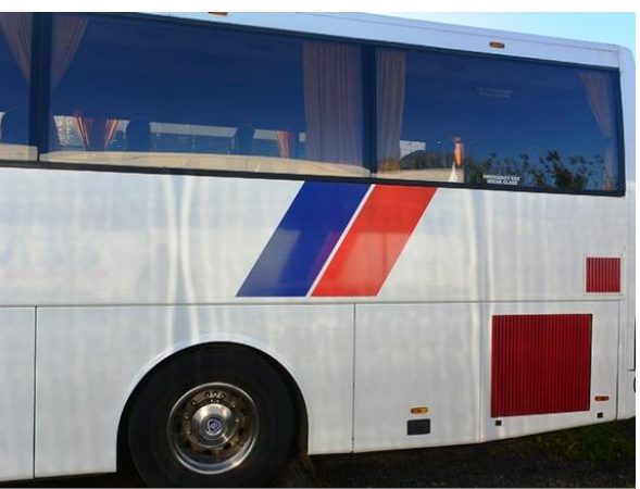
Scania K124 Van Hool 55 seater Euro 3 coach, reg no C3 BCT (2001), MOT 9/10/21, tachograph reading 1,093,174 kms, air con, 7 speed comfort shift, fitted Euro 4 exhaust, interior refurb undertaken 4/5 years ago