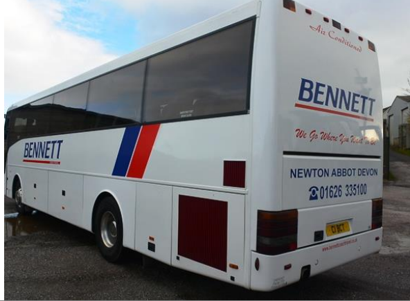
Scania K114 Van Hool Alizee II 49 + 4 executive seater Euro 4 coach, reg no C1 BCT (2003), MOT 6/12/20, tachograph reading 748,307 kms, fitted central toilet, air con, 7 speed comfort shift, with seating and floor plan to configure into 53 seater