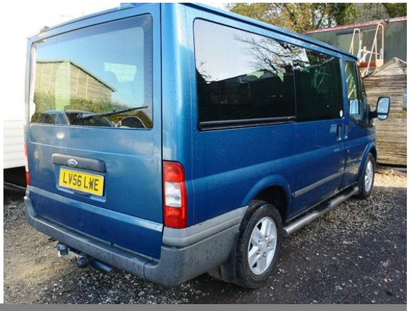
Ford Transit Tourneo GLX 130 diesel 9 seater mini bus, reg no LV56 LWE(2006), MOT 2/10/21, recorded mileage 236,945, replacement engine from Ford approx. 80,000 miles previous, fitted alloys and tow bar