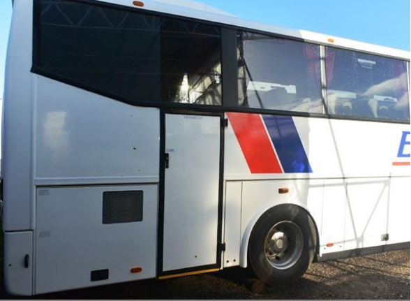
Bova Futura 38 seater executive Euro 4 coach, reg no C9 BCT (2006), MOT 29/9/21, tachograph reading 746,700 kms, fitted rear floor toilet, air con, TV, ZF Auto box, part leather effect, 10 m length