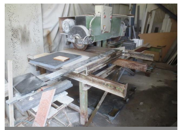
Twin blade, steel-frame mounted stone saw, approx. distance between blades 1.2m, 3phase (constructed on-site)