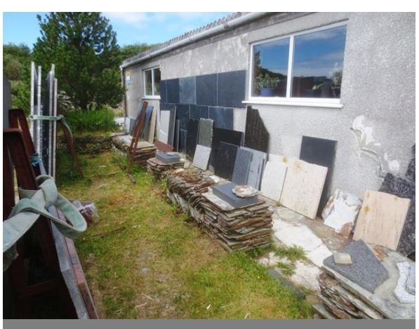
Large quantity of various stone stock, off-cuts, etc.