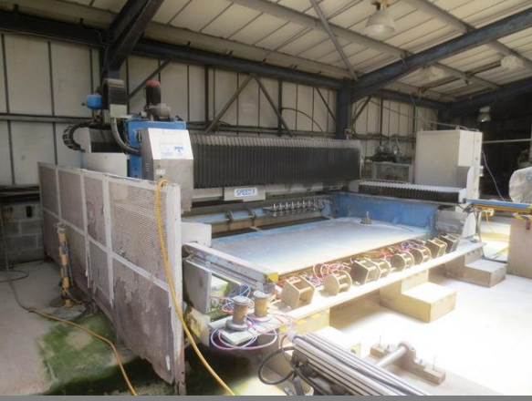
CMS Tension Nominal 400, Brembana Speed 3, bridge type CNC machine centre s/n: 2771 (3phase), with GF Fanuc Series 180i-M control and Viale 5210 coding unit and 12 tool holder capacity (2001)