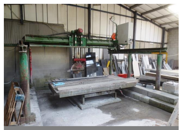
Spiel Vogel 356 S, floor bridge type saw, mounted s/n: 90NR4142, Approx. floor plan 3x4m