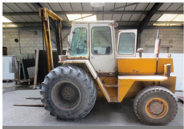
Coventry Climax diesel powered tough terrain, all terrain Dual mast FLT Model: TT3.0 606 s/n: 6060073 lift height 3.8m, 3964hrs