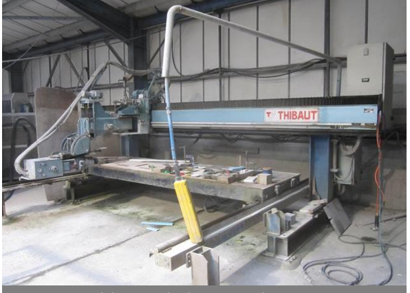
Thibaut T50 bridge type works centre s/n: 4 (1993), 3phase