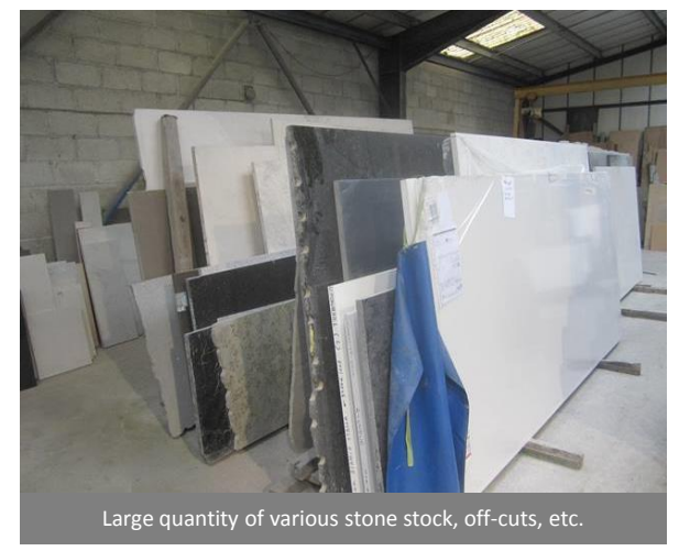
Large quantity of various stone stock, off-cuts, etc.