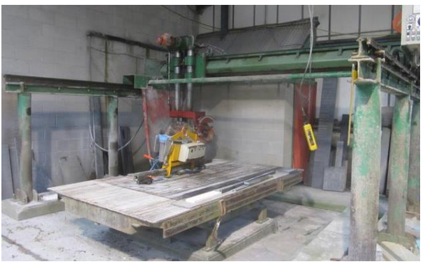
*Please be aware that this is a PPE site - visitors must wear adequate PPE at all times*

ONLINE AUCTION: To bid please go to www.lshmachinerysales.co.uk or