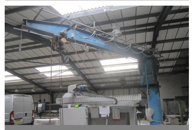
Floor-mounted pillar job crane s/n: 11853, SWL: 1 tonne with Davy Morris Electric Chain block and Bryan Waters vacuum lifter)