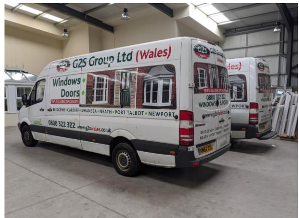
Fleet of commercial and private Motor Vehicles