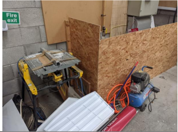
Assorted power tools, Sealey Mig Welder, hand tools, mobile scaffold tower, air compressors, pallet trucks, ladders, trestles, acro props, pressure washer, etc.