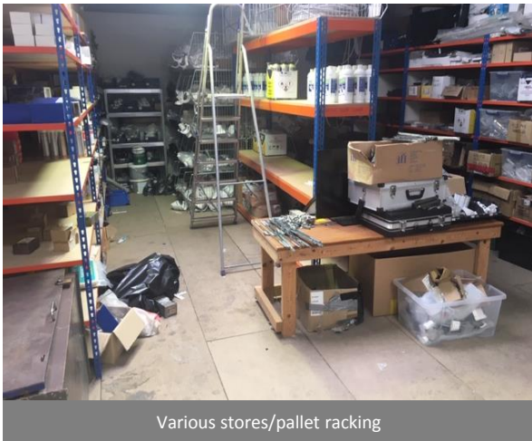
Various stores/pallet racking