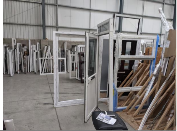
Large Quantity of various UPVC window and door frames, sealed double glazed glass units, etc.