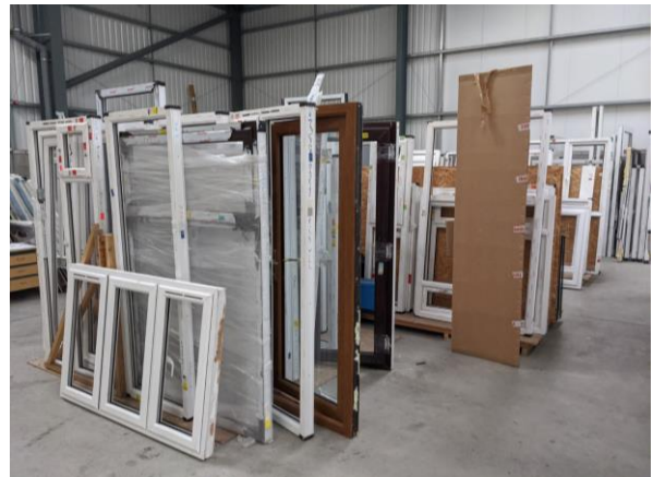
Large Quantity of various UPVC window and door frames, sealed double glazed glass units, etc.