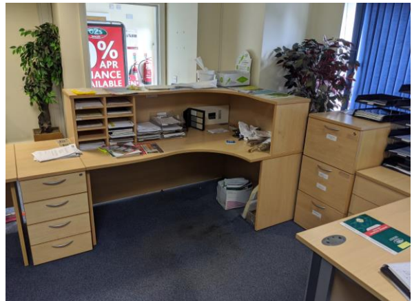
Modern office furniture and equipment