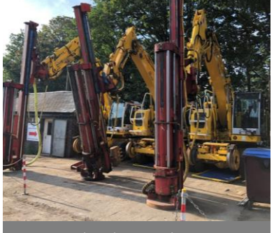
Fambo Piling Attachments