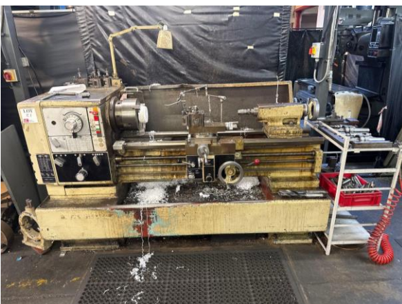
Triumph Colchester Lathe 1200mm bed