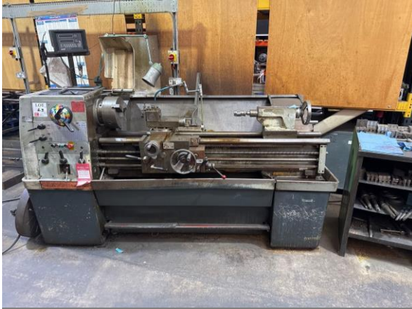
Colchester Triumph 2000 flat bed lathe