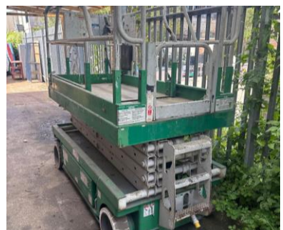
Genie 1000Lb platform lift