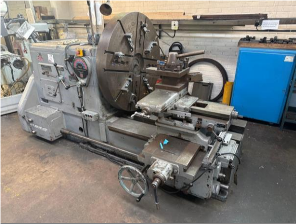
Heyligenstaedt & Comp Boring Machine