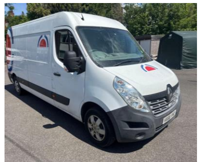
Renault Master LM35