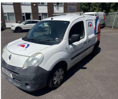
Renault Kango ML19