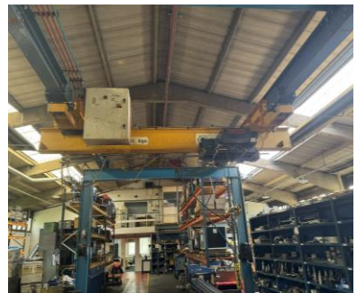
Two Gantry Cranes