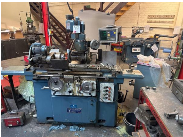
Jones & Shipman Surface Grinder