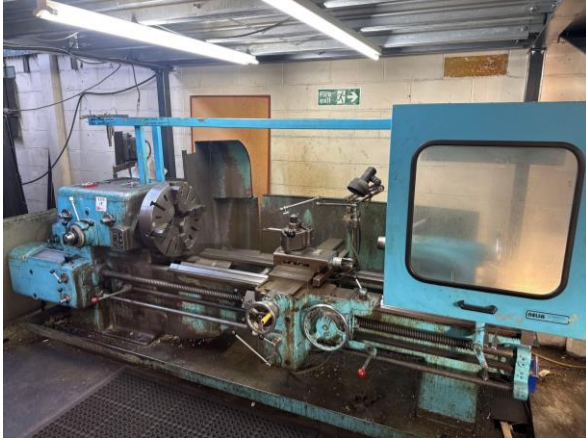
Dean Smith & Grace Type 21 Lathe