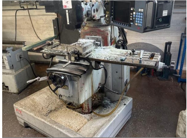
Kingridge SM2000 Vertical Mill