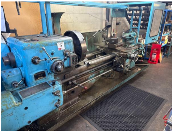
Dean Smith & Grace Type 21 Lathe