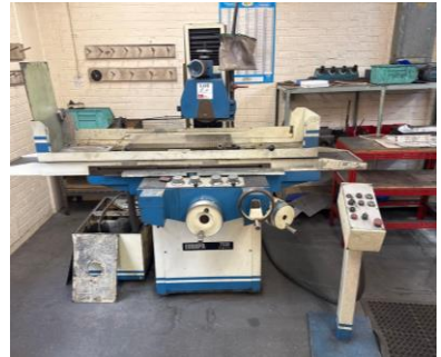
Europa 7530 surface grinder