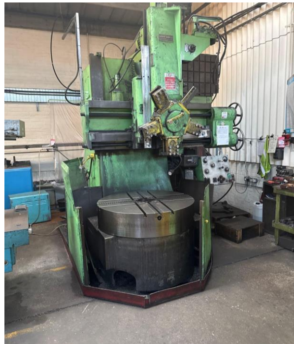
Webster & Bennett Vertical Borer