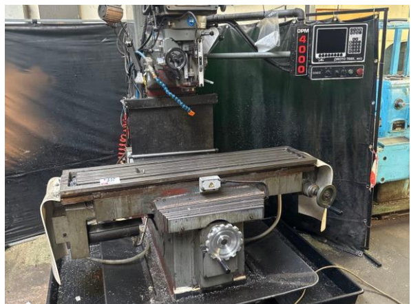
XYZ DPM4000 Vertical Mill