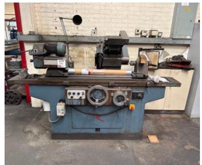
Jones & Shipman cylindrical grinder