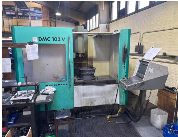
Deckel Maho CNC Machining Centre