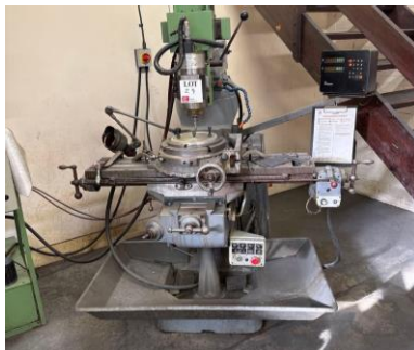
Bridgeport Milling Machine