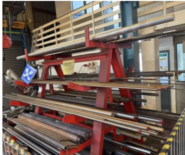
Metal tube & bar stock