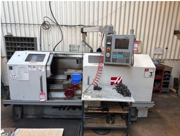
Haas TL3CE CNC Lathe

Vehicles: to include Two Renault Master LM35 LWB medium roof panel vans (2017 & 2016), Ford Transit Connect 2000 diesel panel van (2017), Renault Kangoo ML19 diesel panel van (2014), Peugeot Partner 85D diesel panel van (2016), Hyundai 140 5 door diesel tourer (2015).