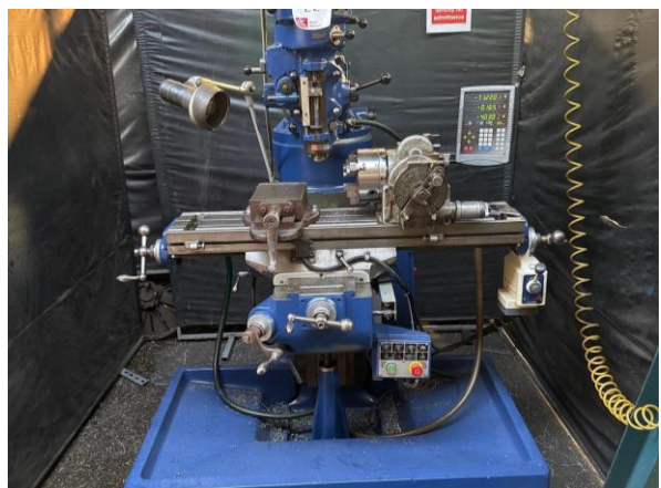
Bridgeport series 1.2HP flat bed lathe