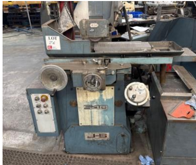
Jones & Shipman surface grinder with magnetic machine vice