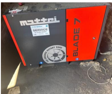
Mattei Blade 7L air compressor set