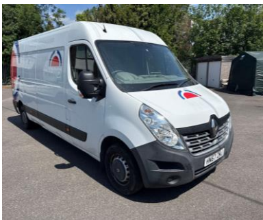
Renault Master LM35