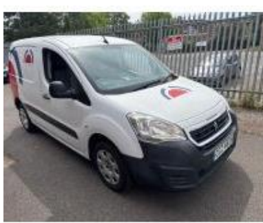
Peugeot Partner 85D