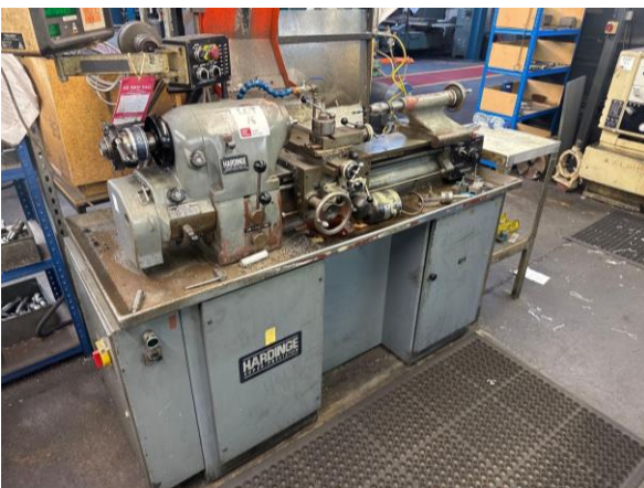
Hardinge KL-1 Lathe