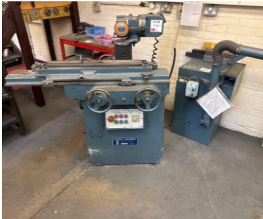
Jones & Shipman cutter grinder