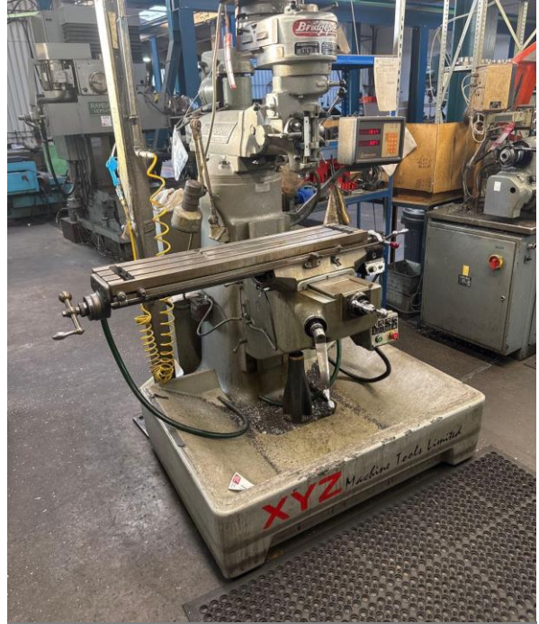
Bridgeport Vertical Mill