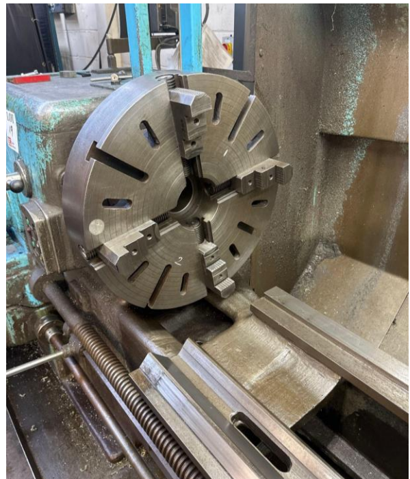
Dean Smith & Grace Type 21 Lathe