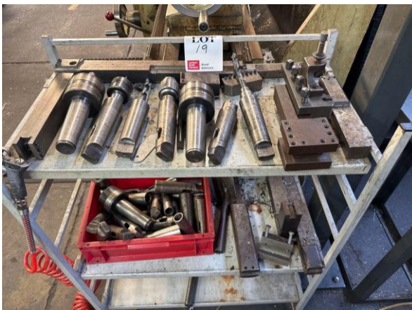
Dean Smith & Grace Type 21 Lathe Tooling