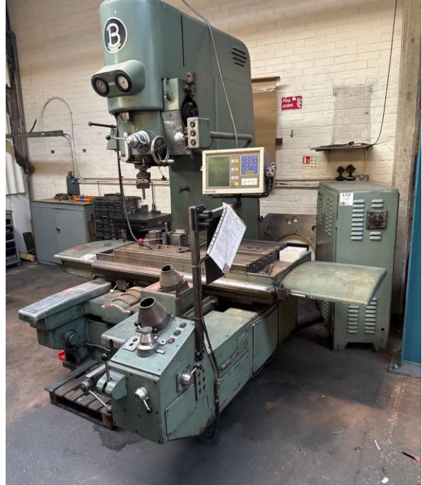
Burkhardt Weber HYOP80 Jig Boring Machine