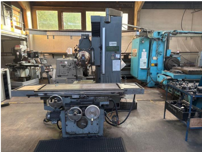
Rambaundi Versa Mill