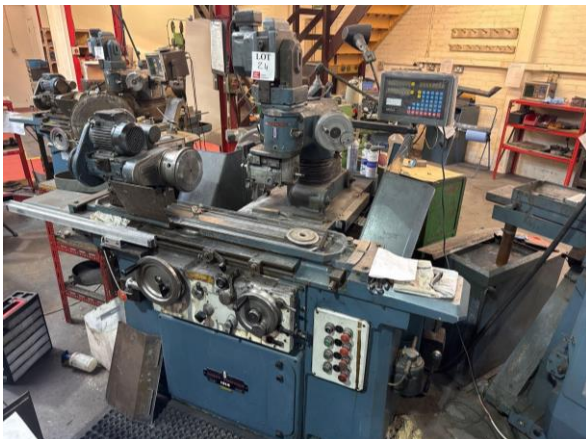
Jones & Shipman Cylindrical Grinder