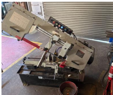
SIP 18" horizontal bandsaw