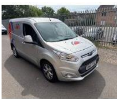
Ford Transit Connect 200