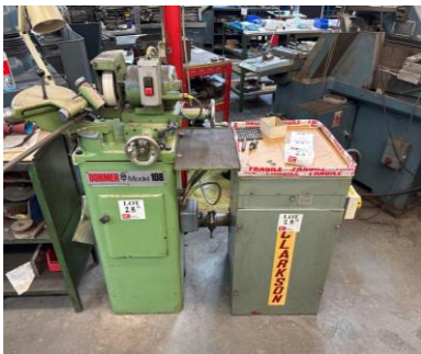
Dorma 108 drill sharpener