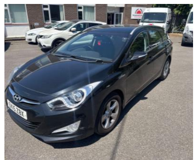
Hyundai 140 tourer