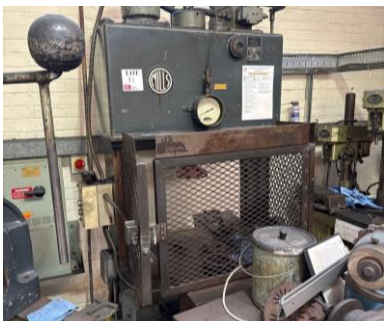
J Mills 25 ton press