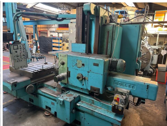
Collett & Engelhard Horizontal Borer