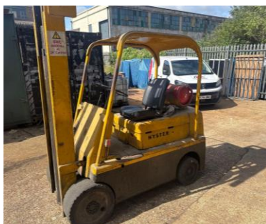
Hyster S80B LB gas forklift