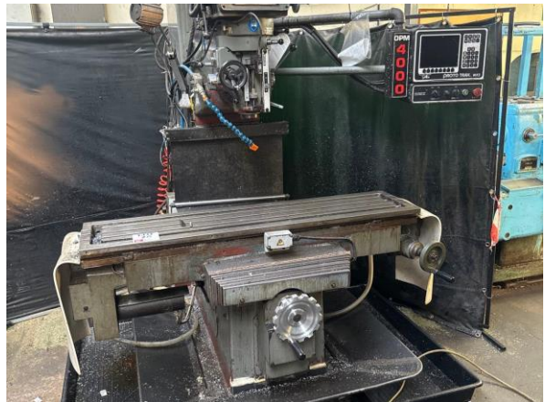
XYZ DPM4000 Vertical Mill