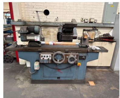
Jones & Shipman cylindrical grinder