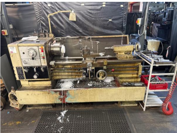
Triumph Colchester Lathe 1200mm bed