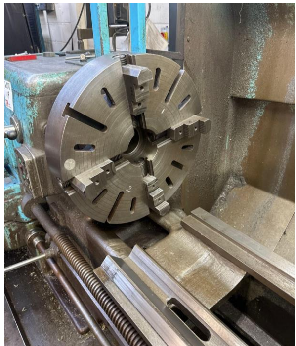
Dean Smith & Grace Type 21 Lathe