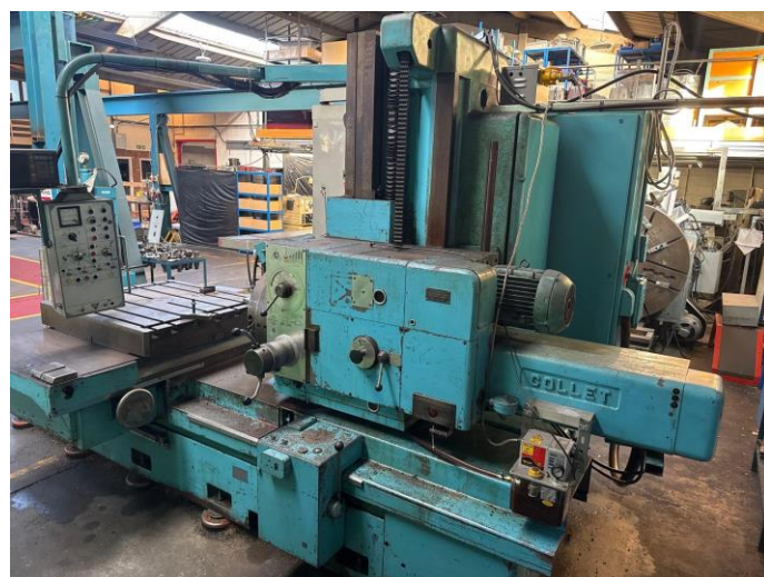
Collett & Engelhard Horizontal Borer