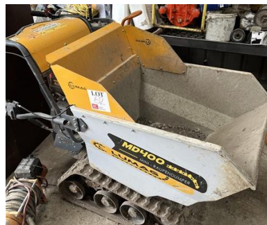
Lumag MD400 mini tracked dumper (2021)