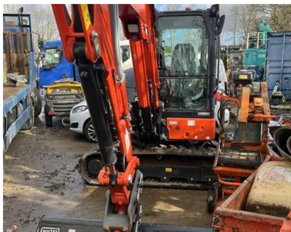
Kubota U56-5 Tracked Excavator Yr (2023)