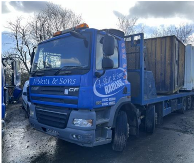
DAF 18Ton plant lorry with tail ramp