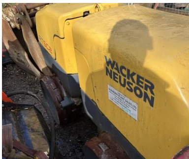
Wacker Neuson RT82-SCZ R/C Trench Roller