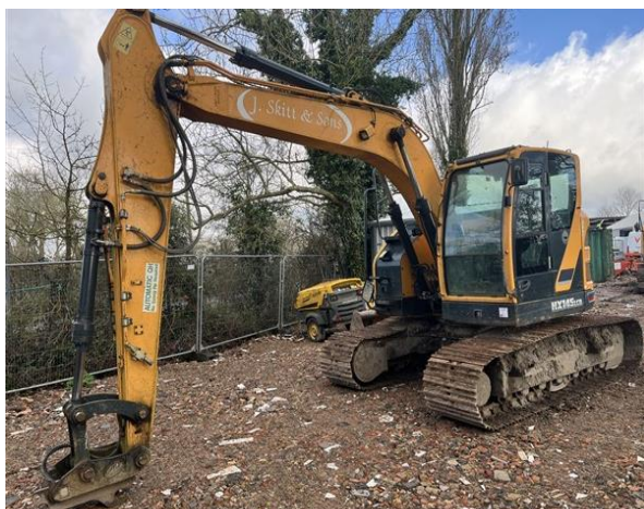
Hyundai HX145LCR Tracked excavator (2017)