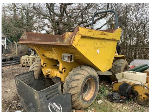
NC Engineering ST10 10Ton Dumper