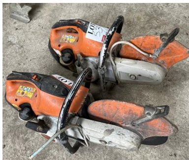
Petrol disc cutters