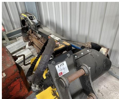
Digga BFT-000017 trencher (2022)