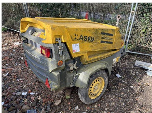
Atlas Copco XAS aircompressor