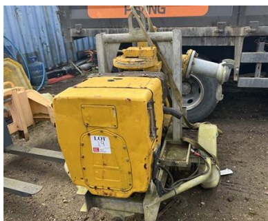
TBBM Diesel water pump 4" pipe with hoses