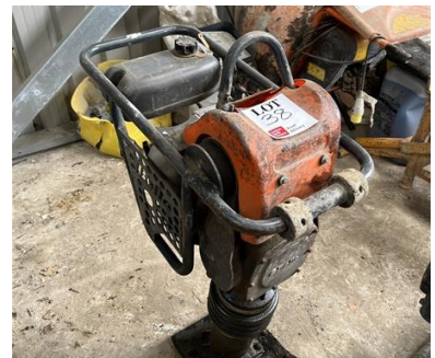
Belle trench wacker compactor