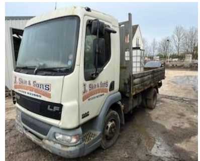
DAF LF Tipper