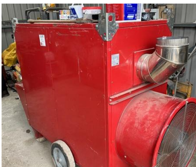
Biemmedue Jumbo mobile heater