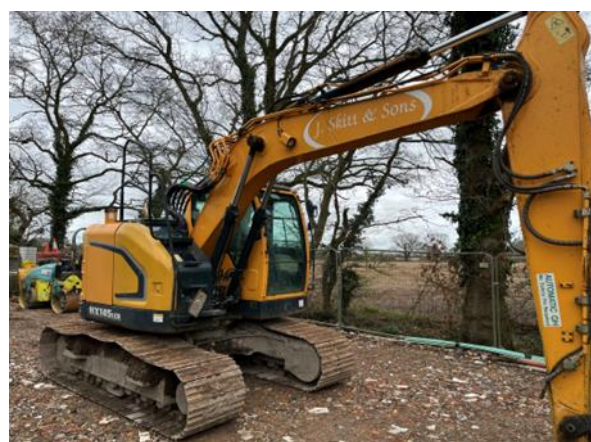
Hyundai 145 ROBEX LCR-9A tracked excavator (2014)