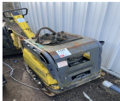
Wacker Neuson DPU100-70 Vibroplate