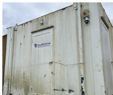
10 foot toilet cabin