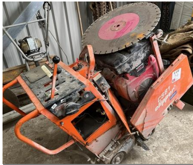
Norton Clipper 600mm road saw