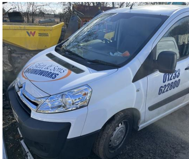
Citroen Dispatch Van