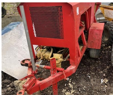
Towable diesel concrete pump