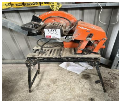
Pull down saw