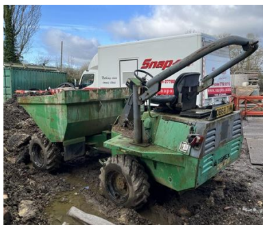
Benford 2 Ton dumper