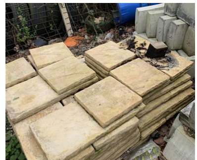
Paving and blocks