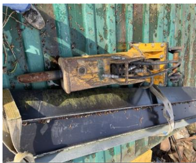
Arrow 8 Ton breaker