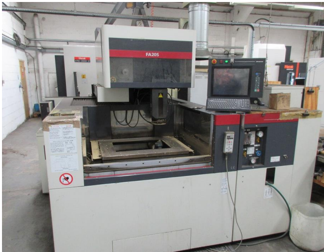
Mitsubishi FA20S CNC wire eroder