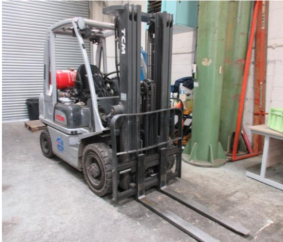
Unicarriers TCM 25 LPG forklift (2016)