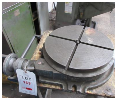
Jones & Shipman Rotary table