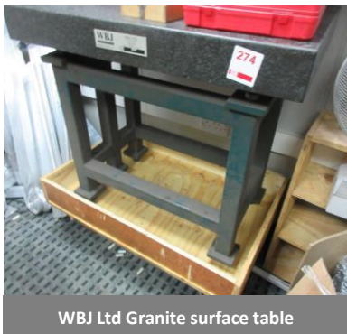
WBJ Ltd Granite surface table