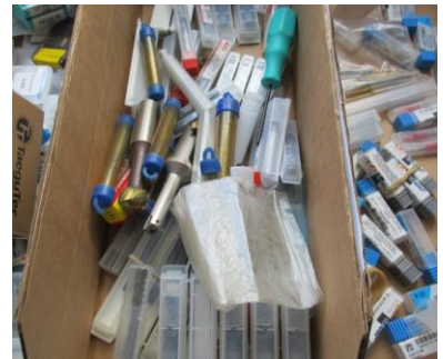
Selection of tool holder, cutters, , insert, carbide tips, drill bits etc