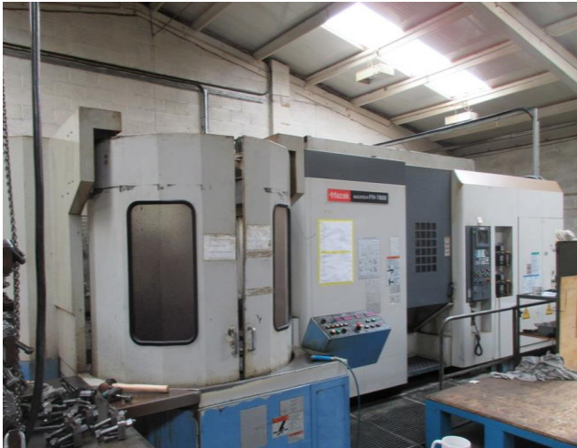
Mazak Mazatech FH-7800 5 pallet CNC horizontal machining centre (2002), Mazatrol Fusion 640m control, 180 ATC, with swarf conveyor and coolant clarifier