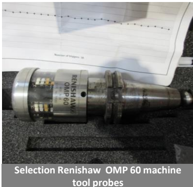
Selection Renishaw OMP 60 machine tool probes