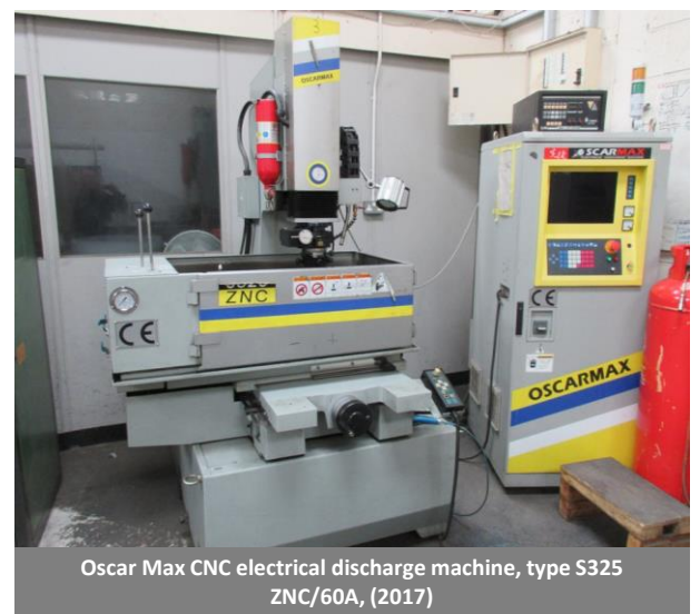
Oscar Max CNC electrical discharge machine, type S325 ZNC/60A, (2017)