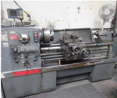
Colchester Mascot 1600 gap bed centre lathe