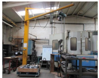
Pillar jib arm cranes ( 4 off)