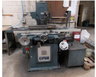
Jones & Shipman 1400P horizontal spindle surface grinder