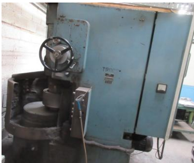
Lumsden 24" rotary grinder machine