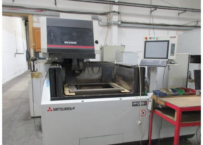
Mitsubishi MV2400R CNC wire eroder (2014), Advance Plus control