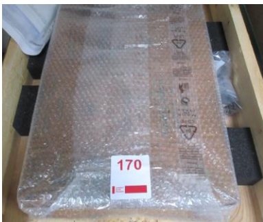
Magnetic chucks, unused