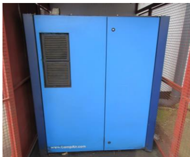
Gardner Denver SL23RS-13A air compressor set (2015)