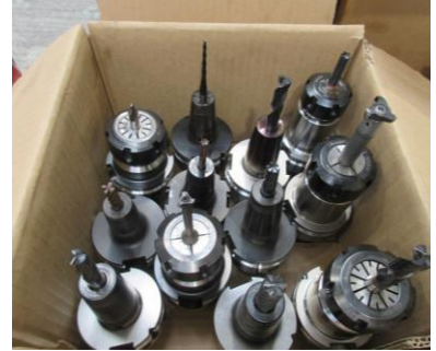
Selection of tool holder, cutters, , insert, carbide tips, drill bits etc