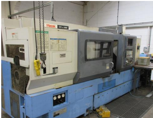
Mazak Super Quick Turn 28M CNC slant bed turning centre, SQT23M, (1995), Mazatrol T Plus control, 12 station rotary turret