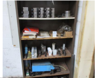
Selection of tool holder, cutters, , insert, carbide tips, drill bits etc