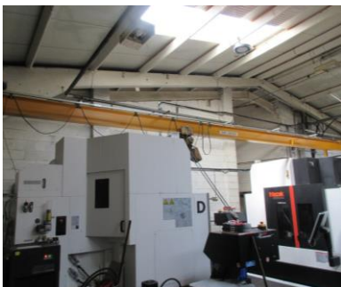
Crane Gantry ( 2 off)