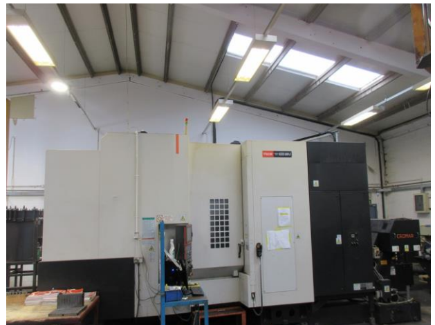
Mazak Nexus HCM - 6800 II twin pallet CNC horizontal machining centre (2008), Mazatrol Matrix Nexus control, 120 ATC