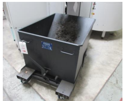
Selection of mobile forklift swarf tipping skips