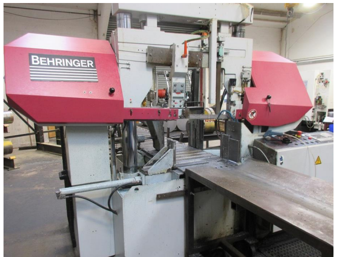
Behringer HBP413A automatic horizontal bandsaw (2012)