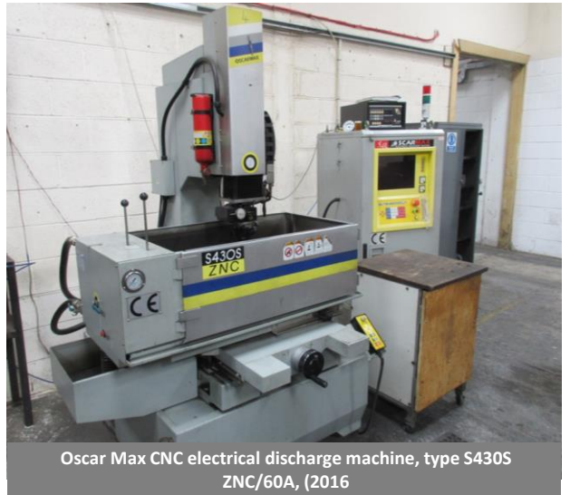
Oscar Max CNC electrical discharge machine, type S430S ZNC/60A, (2016)