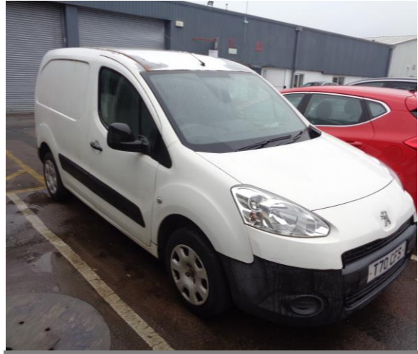
Peugeot Partner 850 HDI Van (2014)