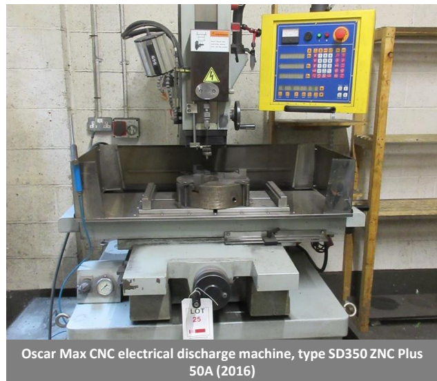
Oscar Max CNC electrical discharge machine, type SD350 ZNC Plus 50A (2016)