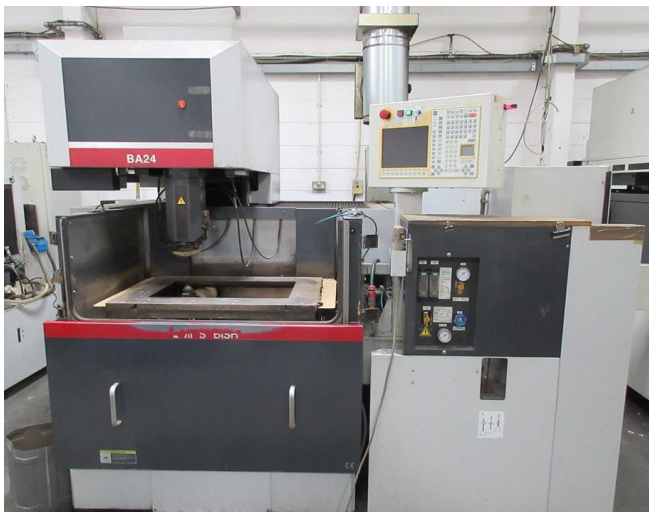
Mitsubishi BA24 CNC wire eroder