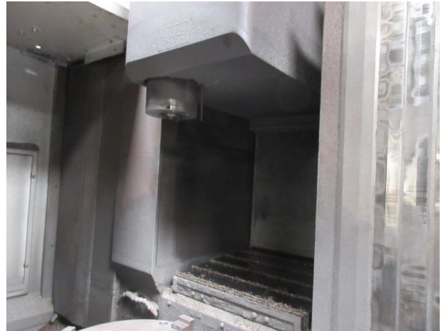
Mazak VTC-300C-II vertical machining centre, serial no. 212034 (2009), Mazatrol 640m control, 48 ATC