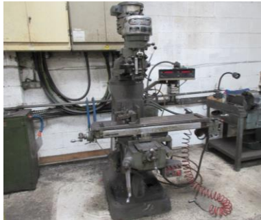
Bridgeport turret mill