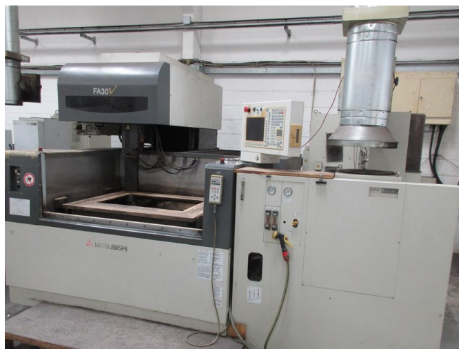
Mitsubishi FA30V CNC wire eroder