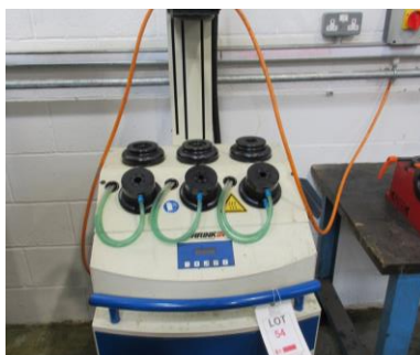
Iscar-ETM Shrink in induction unit