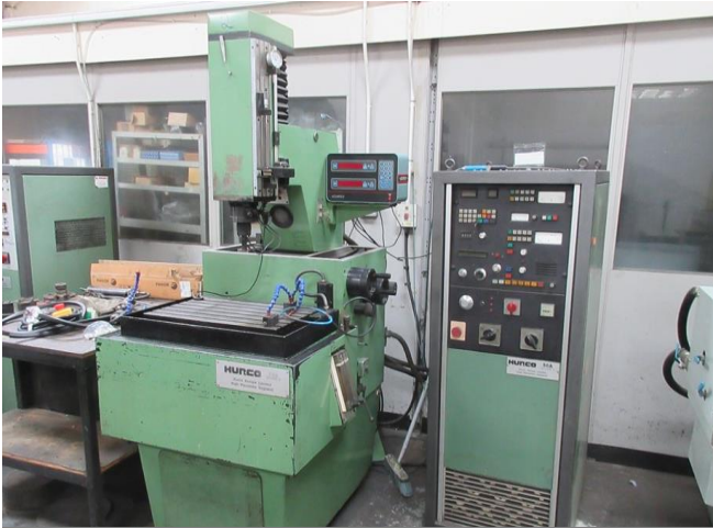
Hurco 900 MK2 electrical discharge machine (2 off)