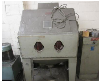
Guyson shot blaster, type DBH 6-/40