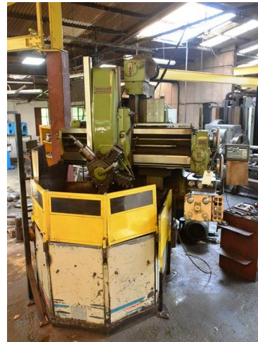
Webster & Bennett 36" elevating rail vertical borer, 5 station turret, fitted Newall DP 700 digital read out, and guard