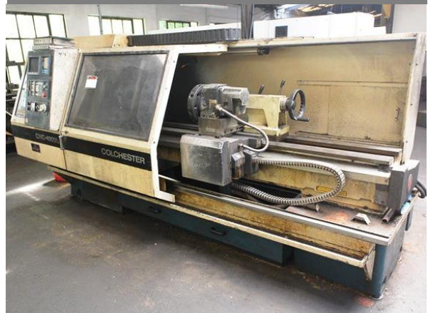
Colchester CNC 4000L CNC SS & SC centre lathe, serial no. L4/805FBSA/01250, GE Fanuc OT control, fitted rotary turret tailstock (out of commission - board gone, ball screws needs replacing)