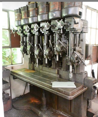
Herbert 6-in-line pillar drill with rise & fall table