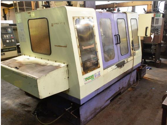
Takumi Serki V11A CNC vertical machining centre, serial no. G0698 (1998), non branded controller, table size 1350 x 500mm, 24 station ATC, fitted 4 axis