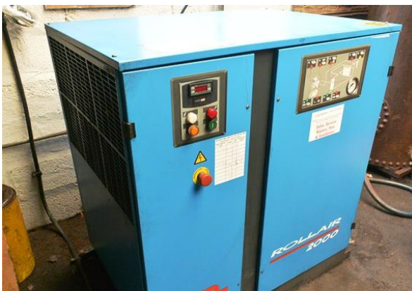
Worthington Creyssensac Rollair 2000 packaged rotary screw air compressor set, model RLR 2000 AE7, serial no. 6730372300/WCO0053112