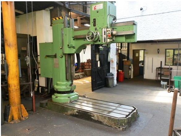
Kitchen & Walker KWM50-1600 elevating column radial arm drill, serial no. 3620 (1997), rise & fall arm.