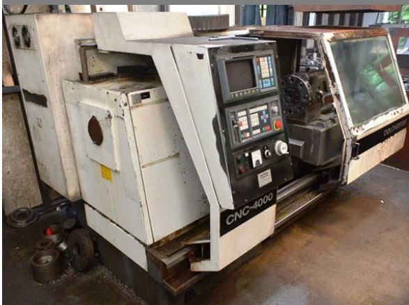
Colchester CNC 4000L CNC SS & SC centre lathe, serial no. L4/805FBSA/01250, GE Fanuc OT control, fitted rotary turret tailstock (out of commission - board gone, ball screws needs replacing)