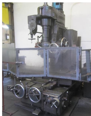
Herbert 47V vertical mill, serial no. 4T17303