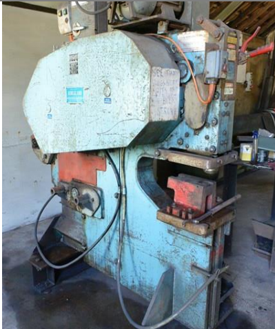
Kingsland J21XA mechanical steel worker, serial no. 212178