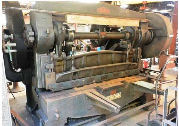
Rushworth 6' x 3/8" mechanical down stroking guillotine with manual back gauge and front supports