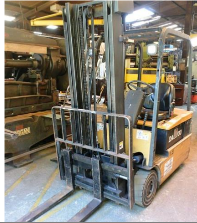
Daewoo 1800kg battery operated, ride on dual mast forklift, model B18T-2, serial no. CM00491, 11,973 recorded hours, fitted side shift,