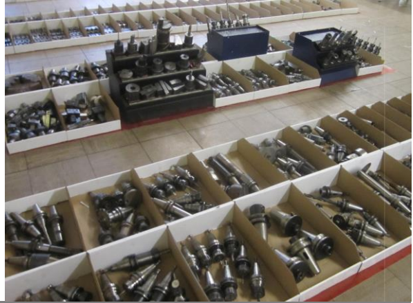
Excellent range of milling adaptors, vices, indexing heads, consumable cutting tools, circa 150 lots