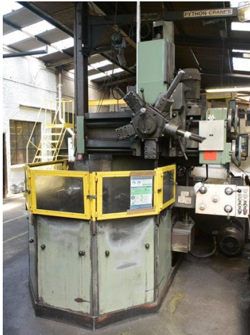
Webster & Bennett 36" fixed rail vertical borer, 5 station turret, fitted Acu-lite DRO and guarding