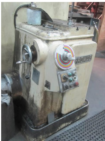
Fromag hydraulic slotter, type KZM 32/300, serial no. AKK26174 (1965)