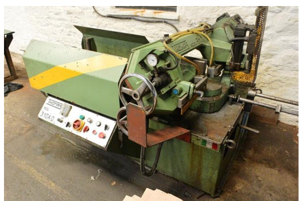
Thomas 310 A.O. mitre base horizontal bandsaw, with auto infeed