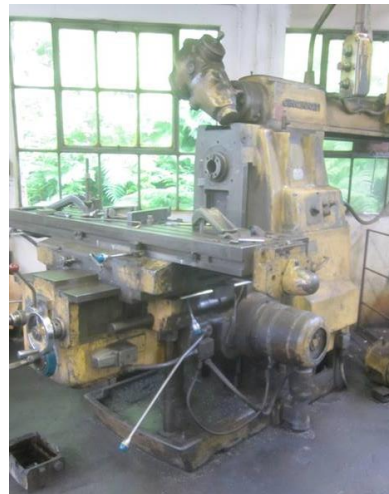
Cincinatti horizontal mill with power over arm, and swivel vertical head, serial no. 11A3F5RE-13, model 310-16 PL EDO, table size 68mm x 16mm, with 3 axis digital read out