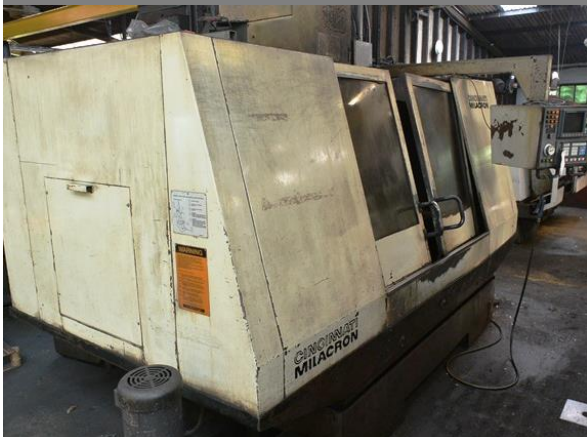
Cincinnati Milacron Sabre CNC vertical machining centre, serial no. 7037-800-RH-0162, GE Fanuc Series O-M control, ATC, table size 1350 x 650mm