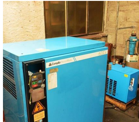
Compair Broomwade 6000E packaged rotary screw air compressor set, with dryer