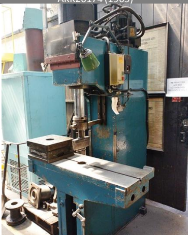
Mills 'C' frame hydraulic vertical press, table size 48" x 15", approx 50 ton