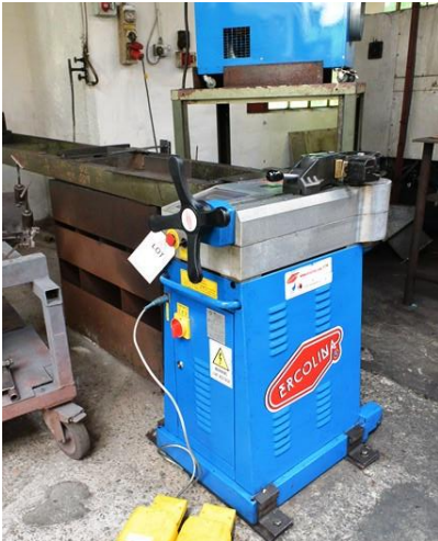
Ercolina TB-76 hydraulic tube bender, serial no. 3307044 (2007), with separate table on feed system