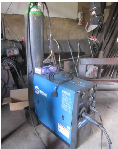
Miller Migmatic 333 mig welder (3 off)