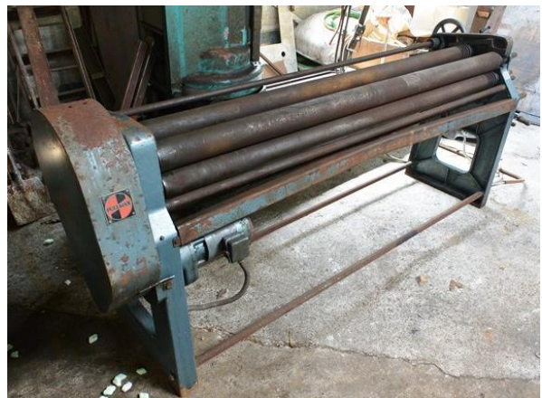
Pullmax 2000mm powered bending rolls