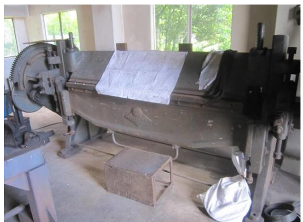
FJ Edwards 6ft hand operated mechanical straight folder