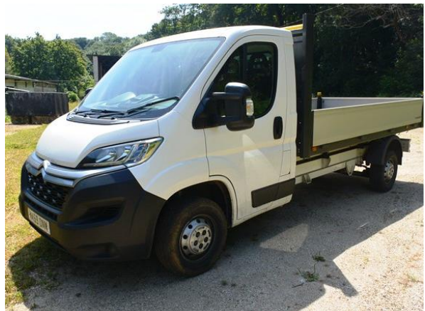
Citroen Relay 35 L3 Blue HDi 2.0 LWB dropside truck, reg no: WK69 ONW (2019), MOT: 1/9/22, recorded mileage: 34,240