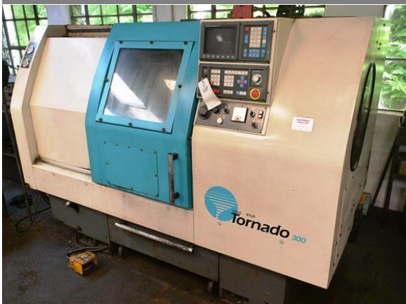
Colchester Tornado 300 slant bed CNC lathe, serial no. C30042 (1995), GE Fanuc Series 0-T control, 8 station rotary turret tailstock and 3 jaw chuck