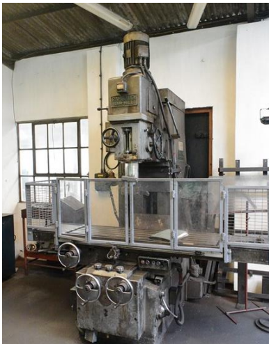
Rambandi Ram-Mill heavy duty vertical mill, 1800 x 500mm table size, fitted guarding