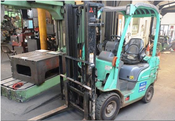
Mitsubishi 1800kg diesel ride on, dual mast forklift truck, model FD18N, serial no. EF16D 40285 (2008)