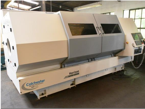
Colchester / Harrison Alpha 1660 XS CNC SS & SC gap bed centre lathe, serial no. X85015 (2020), max rpm 2000, Fanuc Series Oi-TF control, fitted rotary 8 station turret tailstock, 3 jaw chuck