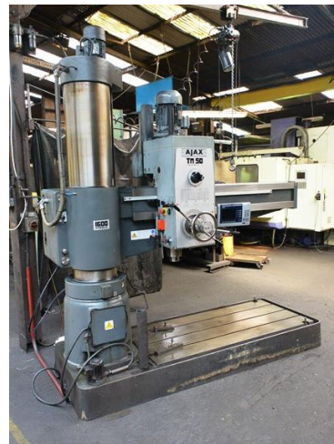
Ajax 1600mm elevating column radial arm drill, model TM50 Series 3/1600 Hydrobloc, serial no. 40008 (2007), radial digital read out