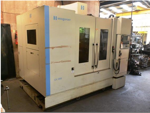
Hardinge Bridgeport GX 1000 CNC 3 axis vertical machining centre, serial no. NVCB1D0061 (2011), Fanuc Series Oi-MD, 20 ATC, table size 1120 x 540mm, max spindle speed 8000 rpm