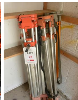
Site Lasers and tripods