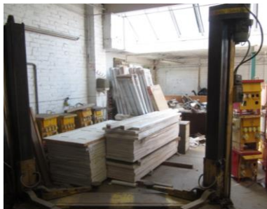
Bradbury 2.5 ton twin post inspection lift