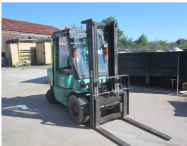
Mitsubishi 35 diesel operated duplex mast forklift truck, model FD35K