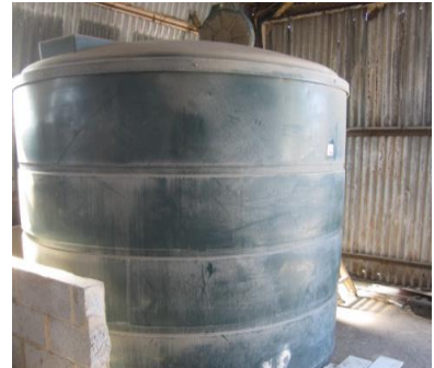
Plastic bunded V5000 fuel storage tank