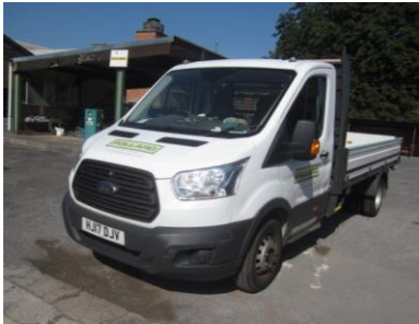
Ford Transit 350 2.2 diesel flat bed dropside (2017)