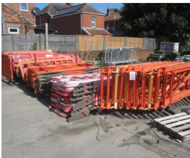
Pedestrian Safety barriers