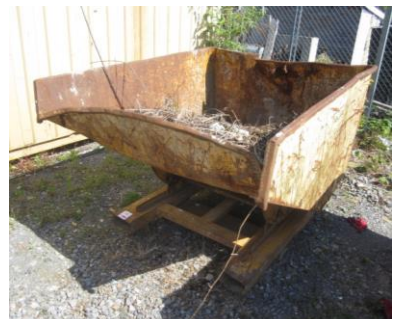
Forklift tipping skips (5 off)