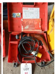
Assorted electrical tools