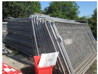
Large Quantity of Heras fencing