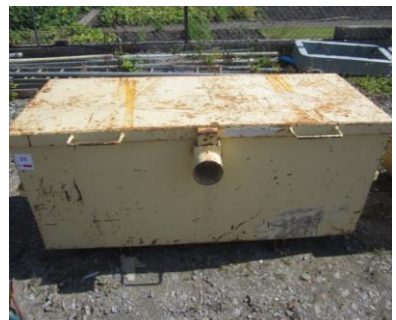
Site tool boxes