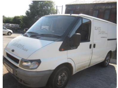
Ford Transit 85 T260 2.0 diesel SWB panel van (2006)