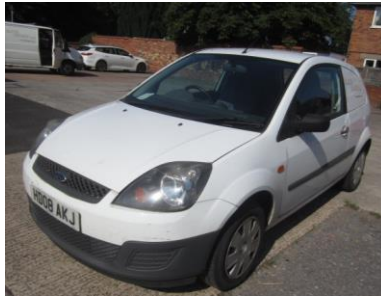
Ford Fiesta TDCi car derived van (2008)