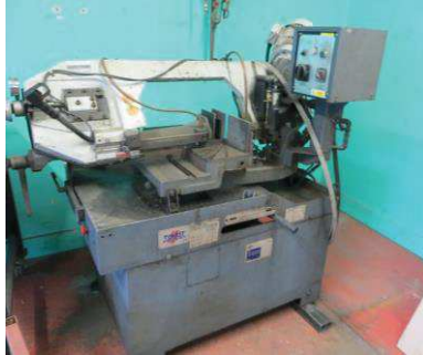
Lot 5 Tomet Double Mitre Bandsaw