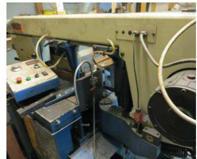
Lot 7 Baileigh Industrial Double Mitre Bandsaw