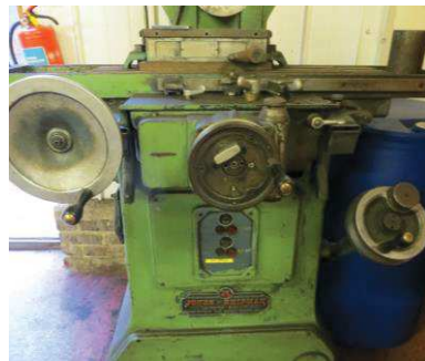
Lot 6 Jones & Shipman Surface Grinder