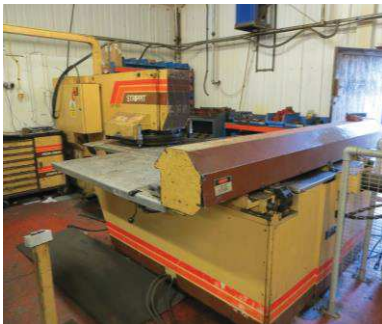
Lot 2 Houdalitte Strippit Punch