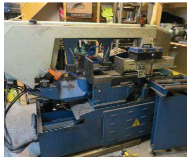
Lot 7 Baileigh Industrial Double Mitre Bandsaw