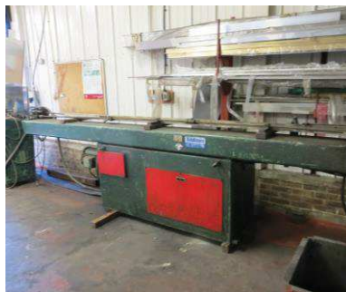
Lot 4 Addison Peorazzoli Tube Bender