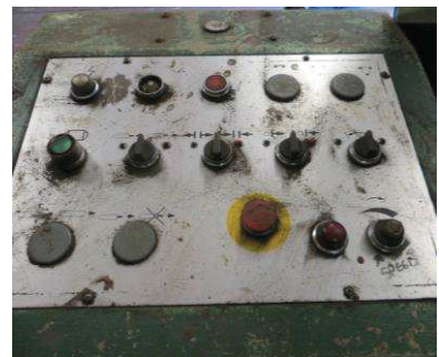
Lot 4 Addison Peorazzoli Tube Bender