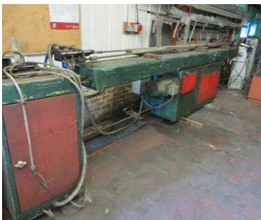
Lot 4 Addison Peorazzoli Tube Bender