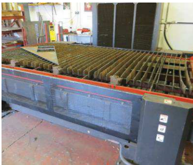
Lot 1 Amada Laser Cutter