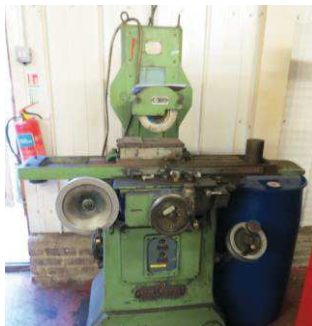
Lot 6 Jones & Shipman Surface Grinder