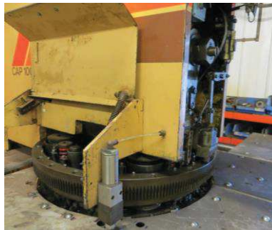
Lot 2 Houdalitte Strippit Punch