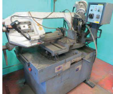
Lot 5 Tomet Double Mitre Bandsaw