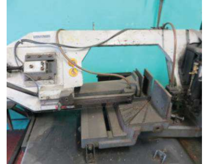
Lot 5 Tomet Double Mitre Bandsaw