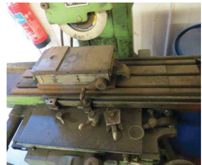
Lot 6 Jones & Shipman Surface Grinder