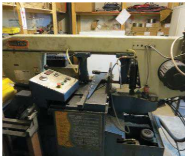
Lot 7 Baileigh Industrial Double Mitre Bandsaw