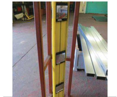
Lot 1 Amada Laser Cutter