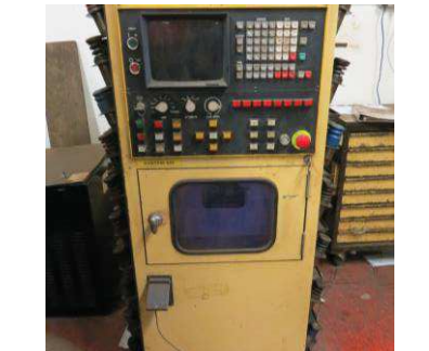
Lot 2 Houdalitte Strippit Punch