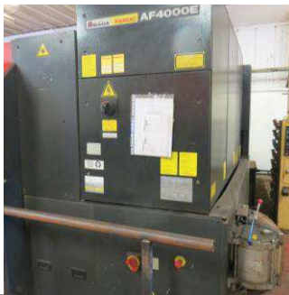
Lot 1 Amada Laser Cutter