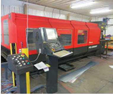
Lot 1 Amada Laser Cutter