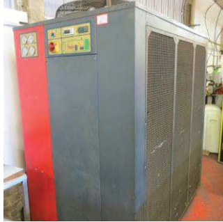
Lot 1 Amada Laser Cutter