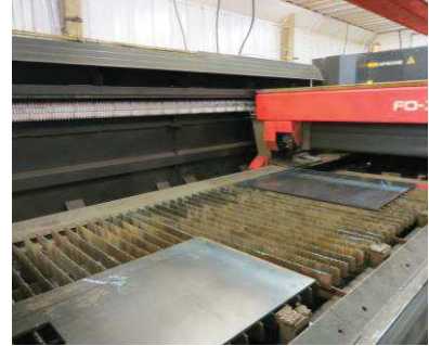
Lot 1 Amada Laser Cutter