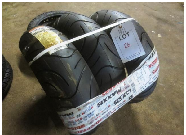
Assorted Motorcycle spares including: tyres, exhausts, luggage, batteries, rims, body panels, consumables, etc.