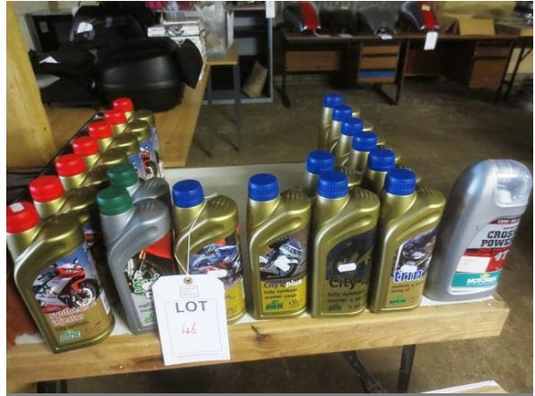
Assorted Motorcycle spares including: tyres, exhausts, luggage, batteries, rims, body panels, consumables, etc.