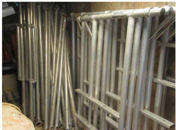
Quantity of aluminium scaffold tower