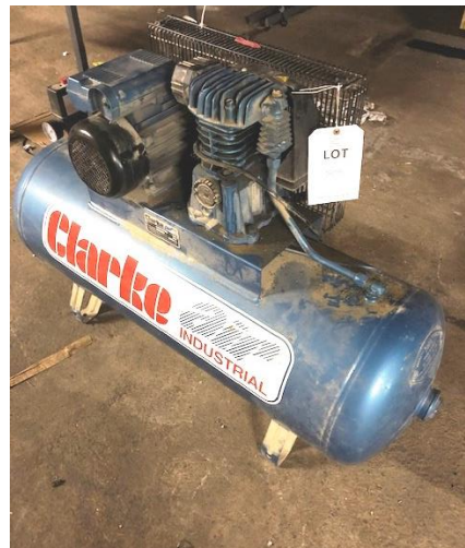
Clarke 150L, receiver mounted 240v compressor