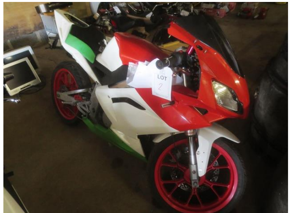
Asprilia 50cc motorcycle, model: RS50 MY06 (2007)