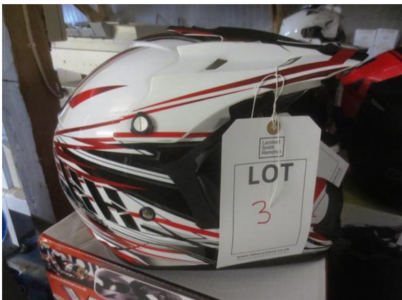
Selection of Motorcycle helmets