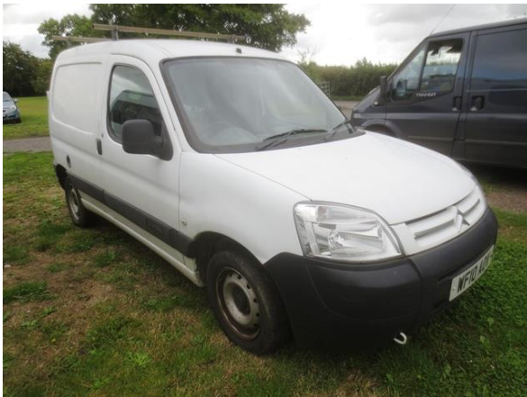
Citroën Berlingo First 600HD, 1,560cc Diesel (2010) 43,600 miles