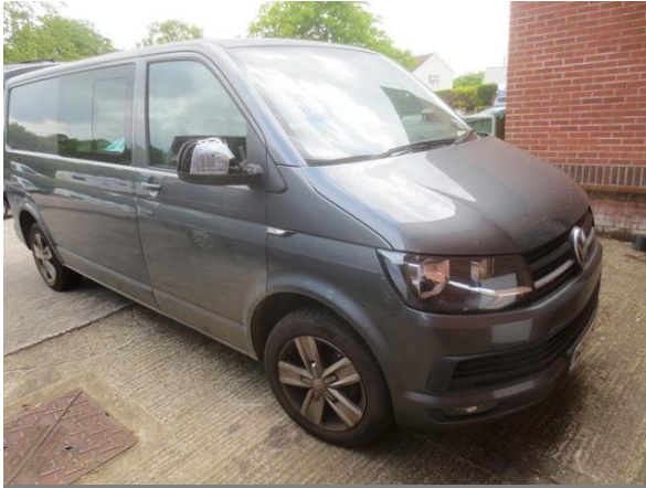
VW Transporter T32 H-line TDi,