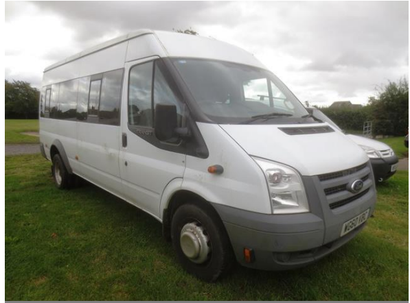
Ford Transit, 17 seater mini bus (2010), 78,500kms