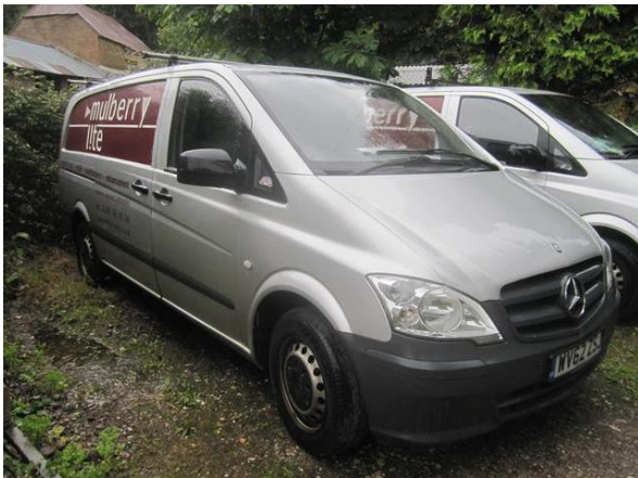
Mercedes Benz Vito 113 CDI 2.1 panel van, (2012), milege: circa 133,500