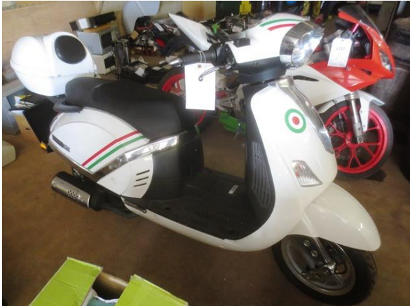
WK Lambretta, type 8, model ISIN scooter