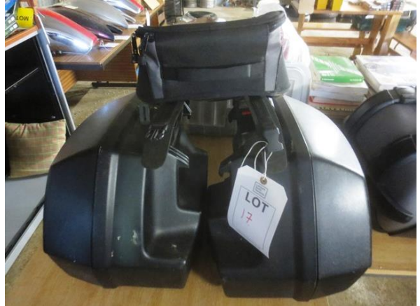
Assorted Motorcycle spares including: tyres, exhausts, luggage, batteries, rims, body panels, consumables, etc.