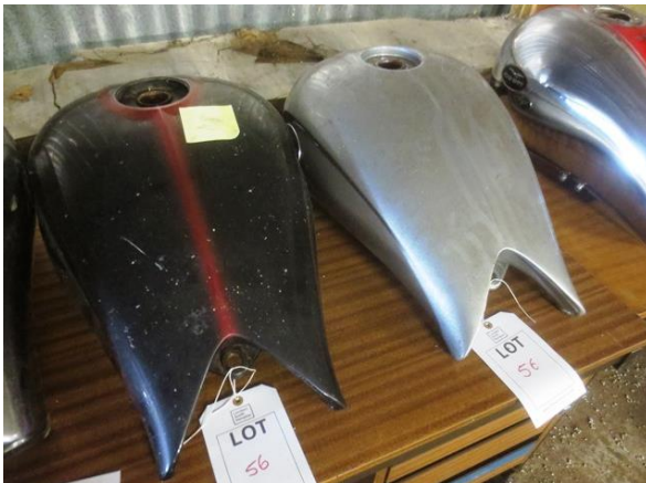
Assorted Motorcycle spares including: tyres, exhausts, luggage, batteries, rims, body panels, consumables, etc.