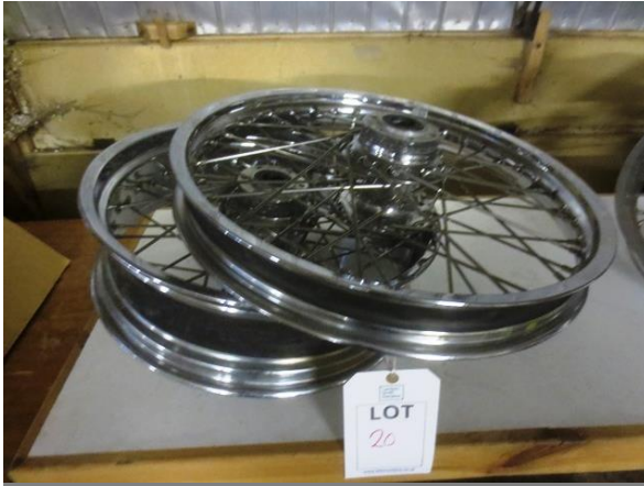
Assorted Motorcycle spares including: tyres, exhausts, luggage, batteries, rims, body panels, consumables, etc.