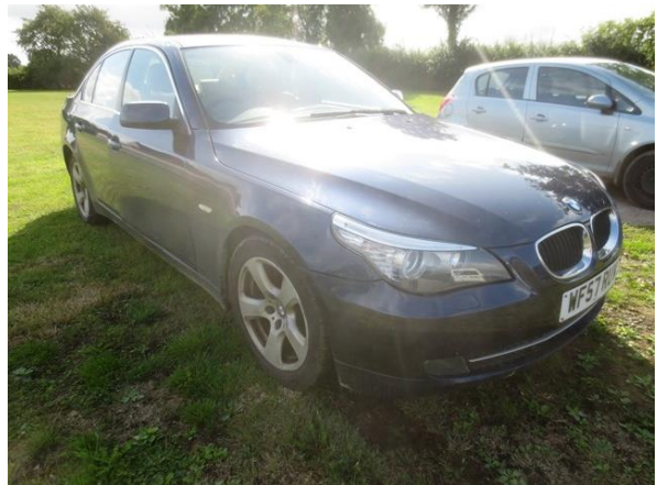
BMW 520D SE auto saloon 1995cc diesel (2007)