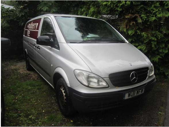
Mercedes Benz Vito 111 CDI long 2.1 panel van (2011), mileage: 168,500