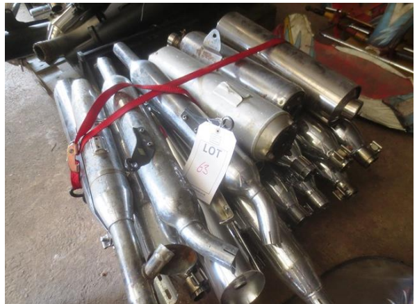
Assorted Motorcycle spares including: tyres, exhausts, luggage, batteries, rims, body panels, consumables, etc.