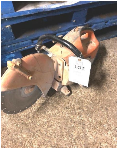
Stihl 420 disc cutter