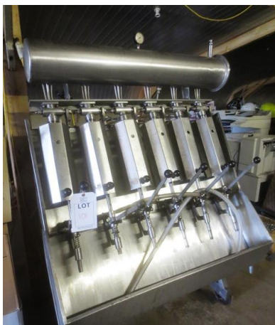
Unbadged 6 station stainless steel bottle filler, hand lever operated, fitted transfer, pump, 2 x vessels, control panel, mounted on stand