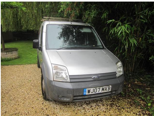
Ford Transit Connect T220 LX110 1.8 diesel panel van (2007)