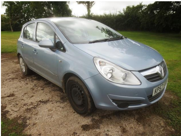
Vauxhall Corsa, CDTI Club AC (2007)