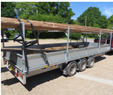
Ifor Williams 18' Triple Axle Trailer