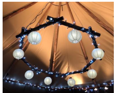
Wooden Hanging Hoops