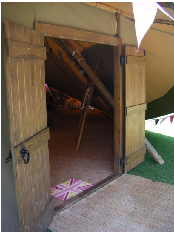
Solid Wood Doors