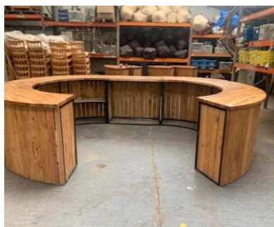
Oblong 5 Section Oak Top Bar