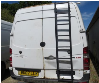
Mercedes Sprinter 311 CDi LWB diesel (2007) manual panel van