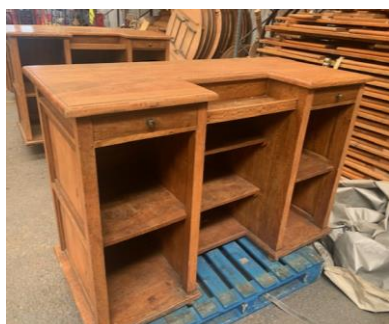
Mango Wood Bar