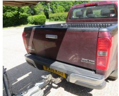
Isuzu D-Max Yukon twin turbo manual diesel double cab pick up (2015)