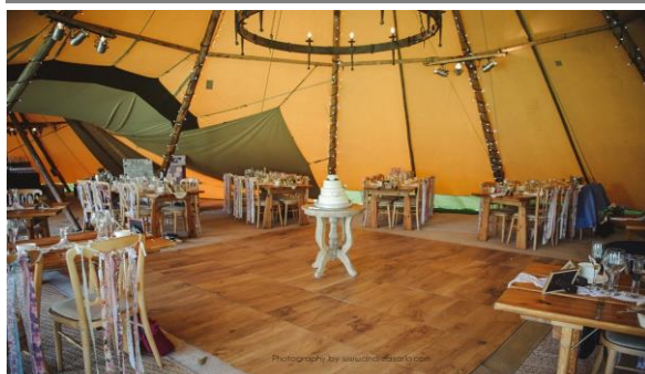
12' x 12' Dance Floor