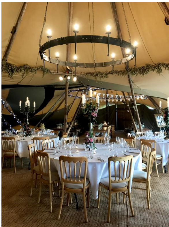
Chandeliers & Candelabras