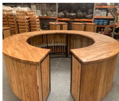
Circular Oak Top Bar