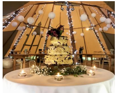
Glass Tea Light Holders