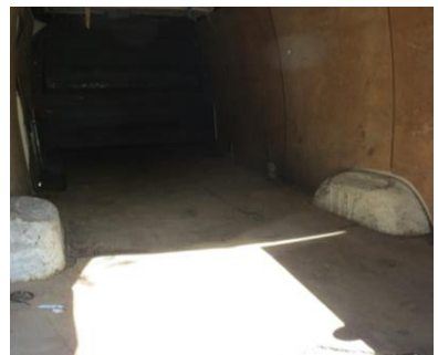
VW Crafter CR35 Tdi LWB 109 diesel panel van (2006)