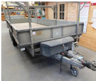
Ifor Williams 18' Triple Axle Trailer