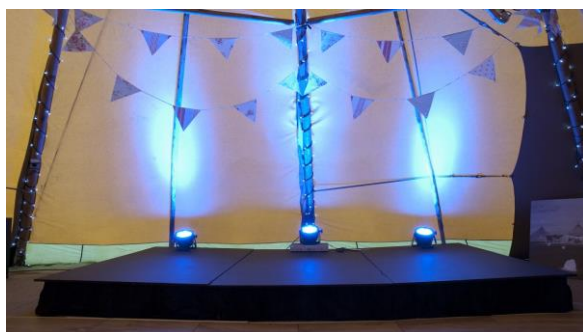
12' x 8' Staging