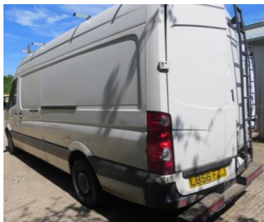
VW Crafter CR35 Tdi LWB 109 diesel panel van (2006)