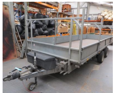
Ifor Williams 18' Double Axle Trailer