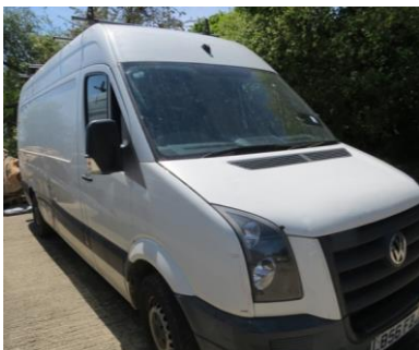
VW Crafter CR35 Tdi LWB 109 diesel panel van (2006)