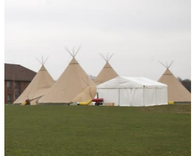
Clearspan Catering Tent