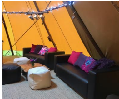
Sofas & Cushions