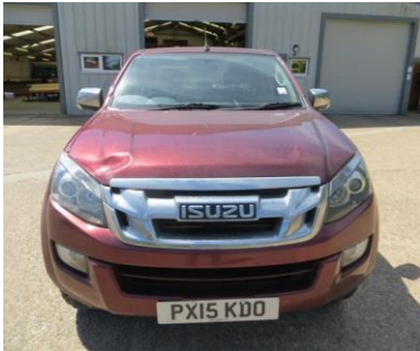
Isuzu D-Max Yukon twin turbo manual diesel double cab pick up (2015)