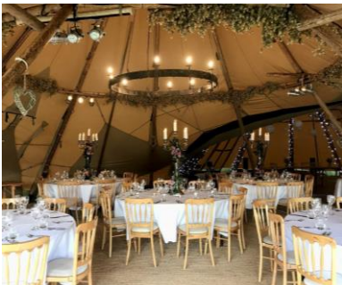
Round Tables & Candelabras