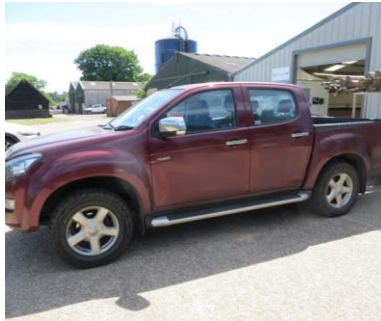
Isuzu D-Max Yukon twin turbo manual diesel double cab pick up (2015)