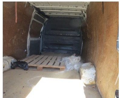
Mercedes Sprinter 311 CDi LWB diesel (2007) manual panel van