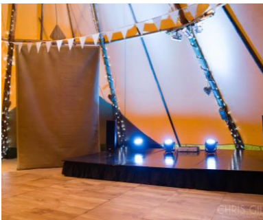
Drape Conceals Staging Lighting