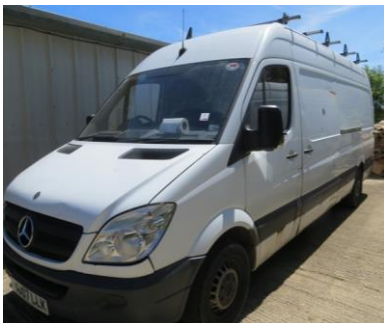
Mercedes Sprinter 311 CDi LWB diesel (2007) manual panel van