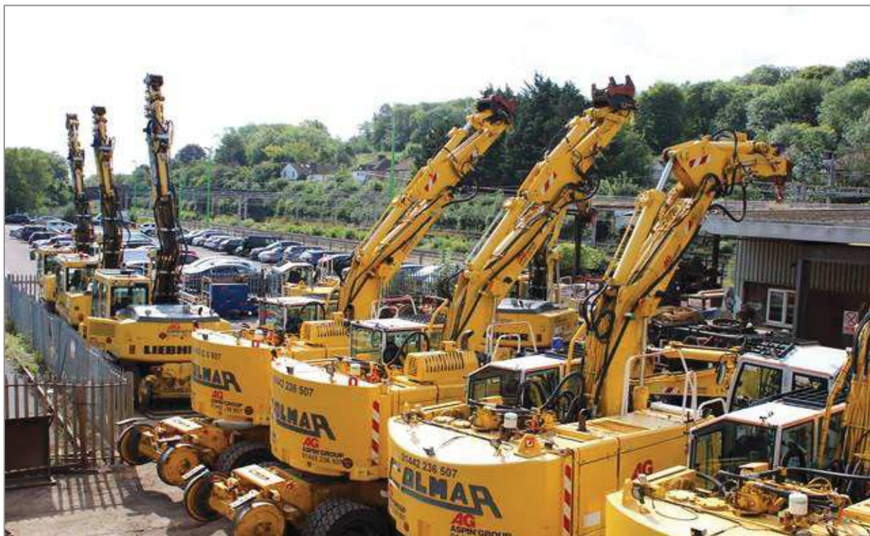
Large selection of Colmar, Liebherr rail road excavators, on track MEWPS, attachments and ancillary equipment