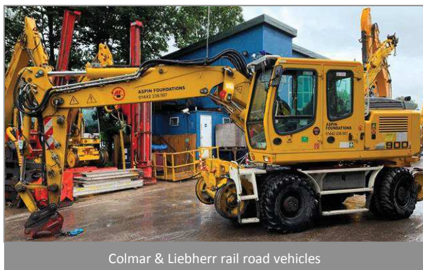
Colmar & Liebherr rail road vehicles