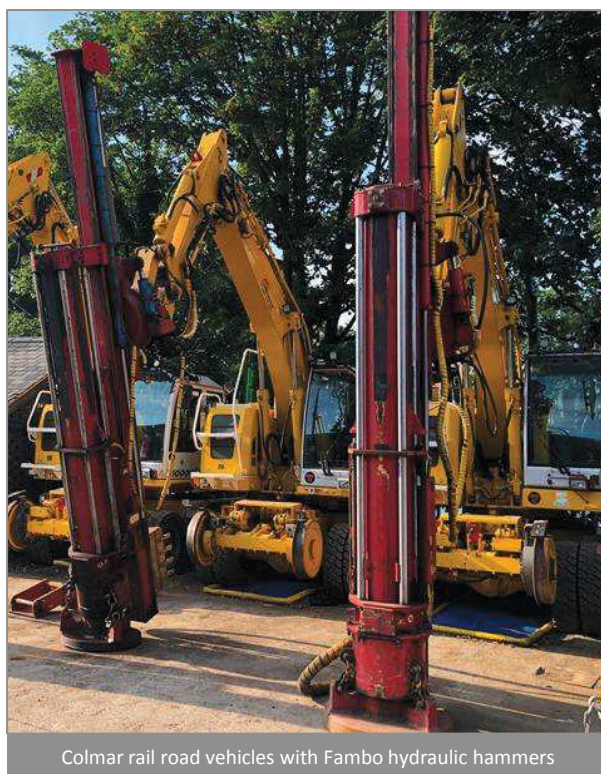
Colmar rail road vehicles with Fambo hydraulic hammers

www.lshauctions.co.uk The property, plant and machinery specialist